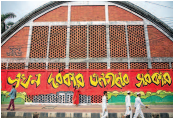
Dhaka University (DU)