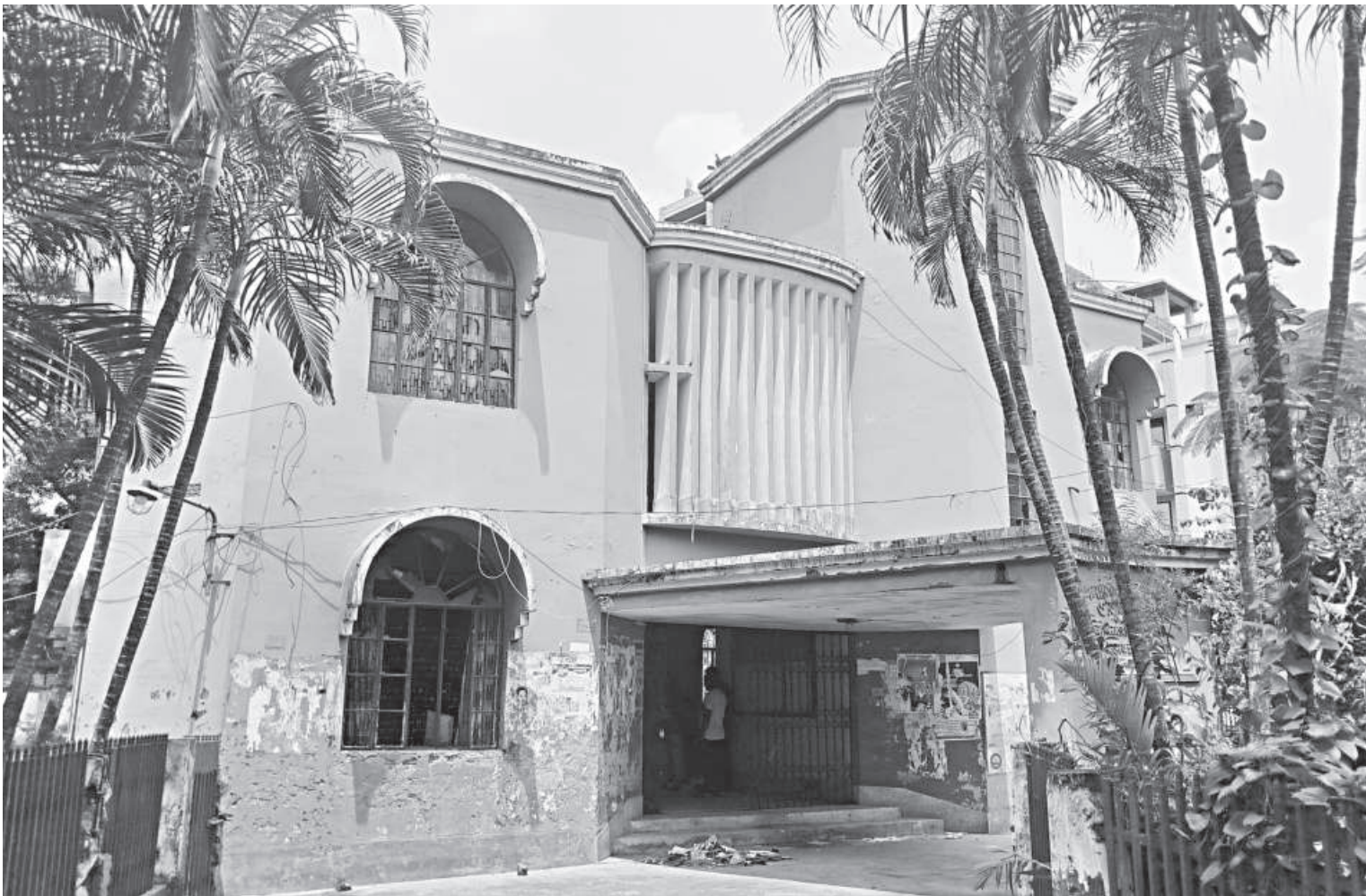
A deserted councillor's office in Mujgunni area (ward-9) of Khulna city. Most of the councillors' offices in the 31 wards of Khulna City Corporation have remained locked following a spree of vandalism and looting after Sheikh Hasina's resignation on August 5.