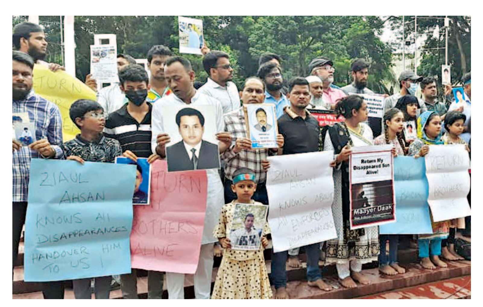
They share a common grief: their sons, husbands, or brothers have been missing for years, allegedly abducted by state agencies during the 15year rule of the Awami League. Families of such enforced disappearance victims formed a human chain in front of the Central Shaheed Minar yesterday. They placed three demands before the interim government and sought a reply within 24 hours. The demands are unconditional and immediate release of their loved ones, trial of those state force members involved in enforced disappearances, and a commission for the victims and their family members under UN supervision. The event was organised by Maayer Daak.