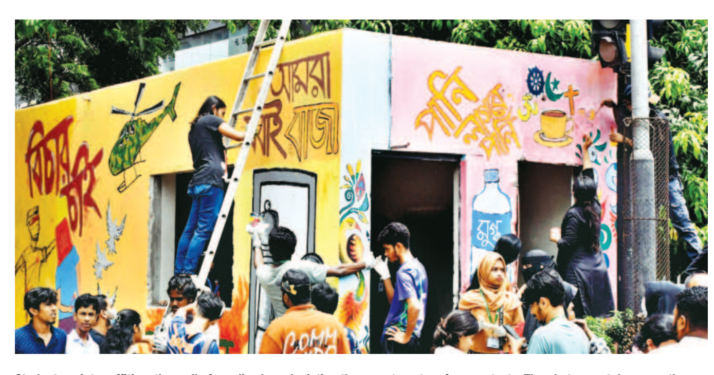
Students paint graffiti on the wall of a police box, depicting the recent quota reform protests. The photo was taken near the Mirpur-1 intersection in the capital yesterday.