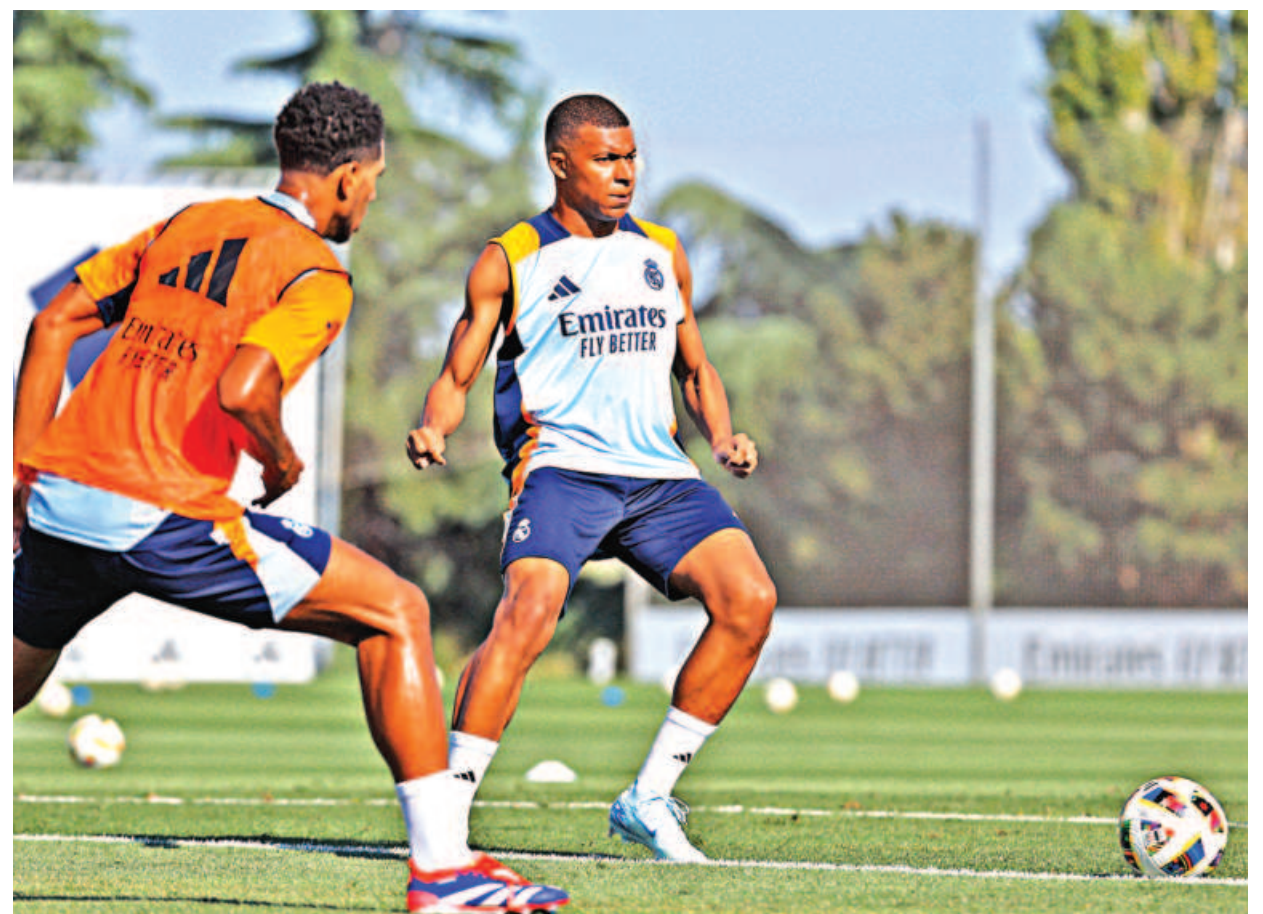
Real Madrid's most sought-after player in recent times, Kylian Mbappe joined Los Blancos' training session for the first time on Wednesday since being presented as the club's new number nine at the Santiago Bernabeu in mid-July. It was the reigning La Liga and Champions League winners' second training session of the pre-season, in which, according to the club's statement, the full squad had reported to training with the return of the players who had taken part in Euro 2024 this summer.