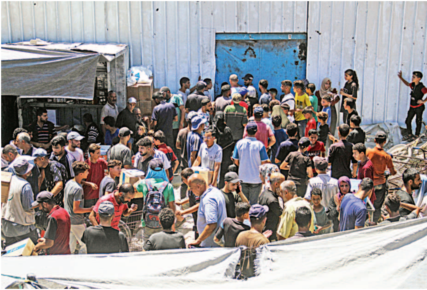
Palestinians gather to receive food at a UNRWA distribution centre amid a hunger crisis in Jabalia in the northern Gaza Strip yesterday. The health ministry in Hamas-run Gaza said that at least 39,699 people have been killed in the Israeli offensive, which is now in its 11th month.

The ex-PM, however, pointed out that he too was manhandled on May 9, as Rangers had dragged him from premises of Islamabad High Court despite the fact that he was "the most popular leader in Pakistan".