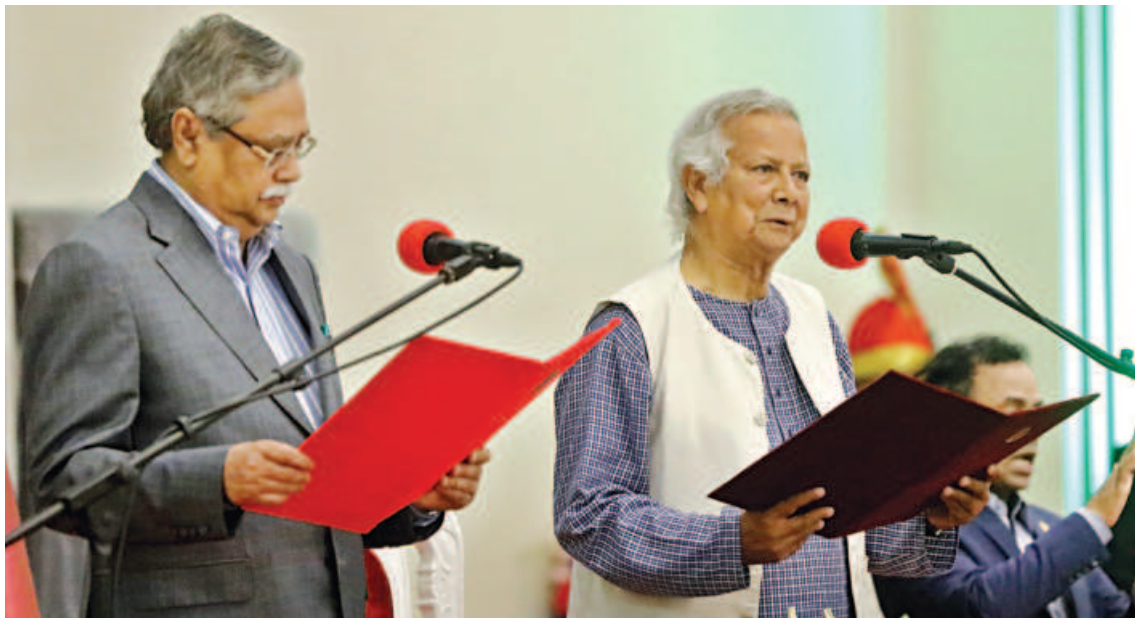
President Mohammed Shahabuddin swearing in Prof Muhammad Yunus as the chief adviser to the interim government at the Bangabhaban last night.