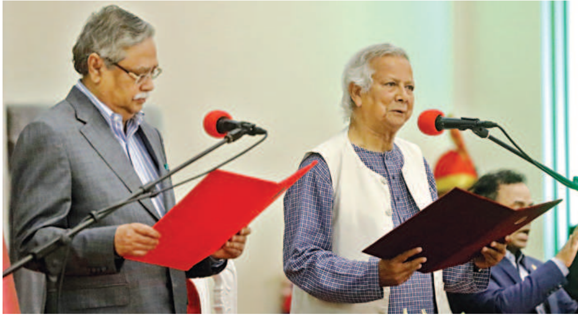
President Mohammed Shahabuddin swearing in Prof Muhammad Yunus as the chief adviser to the interim government at the Bangabhaban last night.