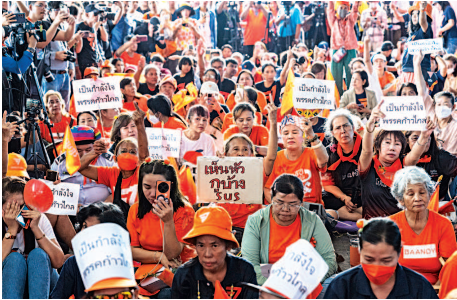
Supporters at the Move Forward Party (MFP) headquarters react after Thailand's Constitutional Court ruled that former MFP leader Pita Limjaroenrat was to receive a decade-long ban and dissolve his party after challenging royal defamation laws, in Bangkok, Thailand yesterday.

He struck a chord with young and urban voters with his pledge to reform Thailand's strict royal defamation law, which rights groups say has been misused to stifle democracy groups.