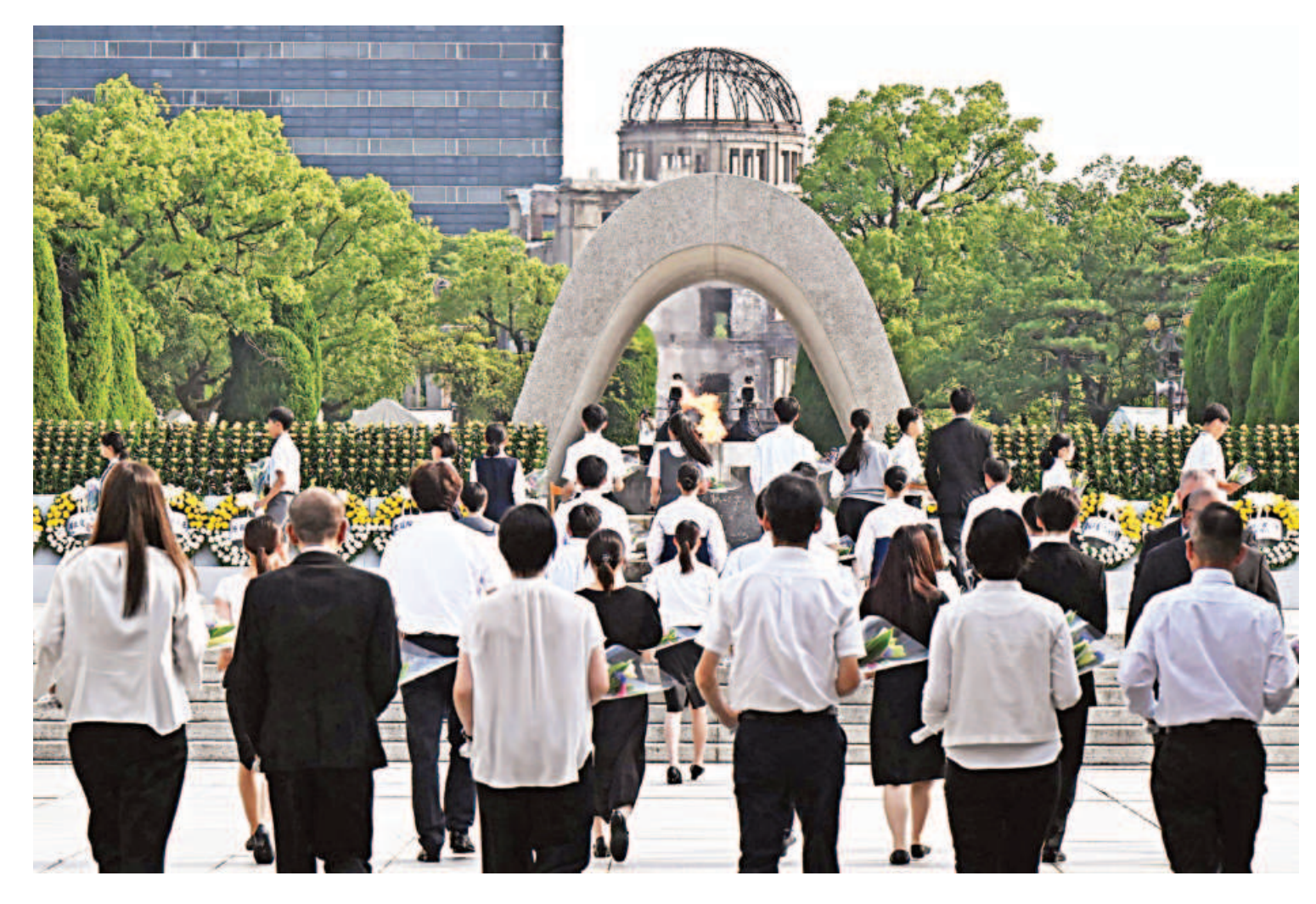
Representatives lay flowers at the Peace Memorial Ceremony held at the Peace Memorial Park in Hiroshima, Japan yesterday, during ceremonies to mark the 79th anniversary of the world's first atomic bomb attack.

The Justice department, which is being forced to release some prisoners early as it battles a jail overcrowding crisis, said nearly 600 prison places had been secured to accommodate those engaged in violence.