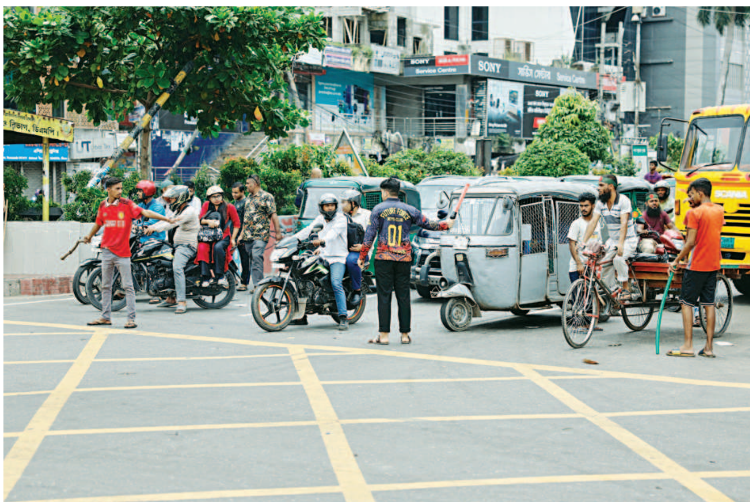
Students are seen controlling traffic at the Bijoy Sarani intersection in Dhaka yesterday, a day after former prime minister Sheikh Hasina resigned and fled the country.