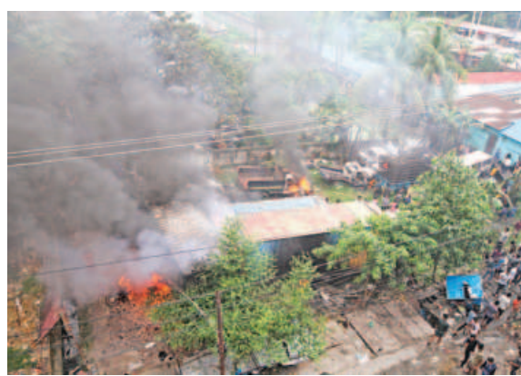
Clockwise from left, a torched AL office in Barishal city. Vandalised SP office in Sylhet. Karnaphuli Police Outpost set on fire in Chattogram. Inset, residence of Ahmadiyya families burnt in Panchagarh. A pharmacy being vandalised in Sylhet.