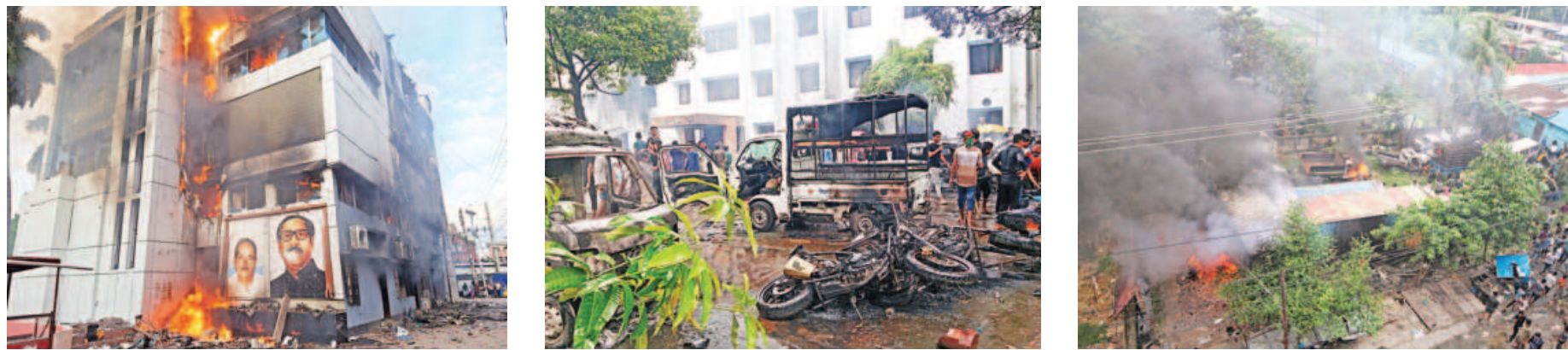
A torched AL office in Barishal city. Vandalised SP office in Sylhet. Karnaphuli Police Outpost set on fire in Chattogram. Residence of Ahmadiyya families burnt in Panchagarh. A pharmacy being vandalised in Sylhet.