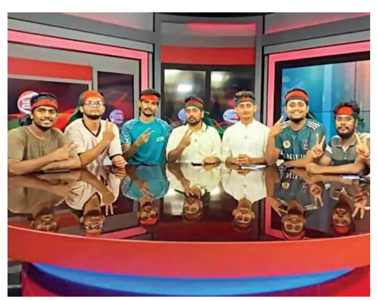
The organisers of the Anti-Discrimination Student Movement pose for a photo during a live television programme yesterday.