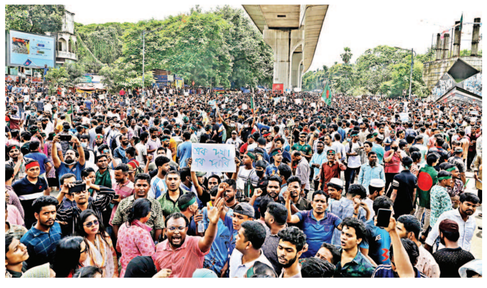
Protesters by the hundreds swarm the Shahbagh intersection in the capital yesterday, where later a fierce clash broke out between them and ruling party supporters on the first day of the nationwide non-cooperation movement announced by the Anti-Discrimination Students' Movement.

At least 90 people, including 14 policemen, were killed and several hundreds injured vesterday as fierce clashes took SEE PAGE 10 COL 1