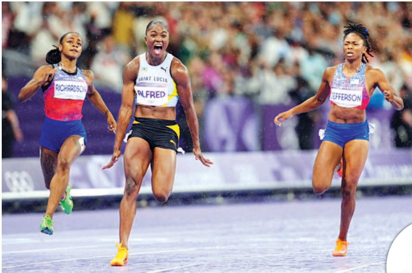
Yesterday was a great day for Caribbean people as they saw two of their athletes bring in glory for their nations in the Paris Olympics. Just 10 minutes after Julien Alfred stunned American world champion Sha'Carri Richardson to win the women's 100 metres final and claim Saint Lucia's first-ever Olympic medal, [bottom middle] Thea LaFond made history for Dominica by winning gold in the triple jump to earn the country's first-ever Olympic medal. Jamaica's Shanieka Ricketts took silver and American Jasmine Moore claimed bronze in the triple jump event.