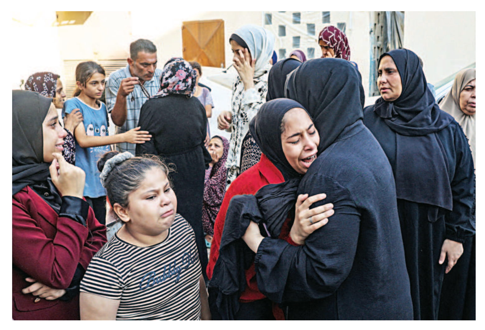
Palestinians mourn the dead in the aftermath of an Israeli strike that hit tents used as temporary shelters by displaced people in the courtyard of the Al-Agsa Martyrs Hospital in Deir el-Balah in the central Gaza Strip vesterday.

Others have called on Venezuela to release detailed vote tallies, including EU states France. Germany, Italy and Spain.