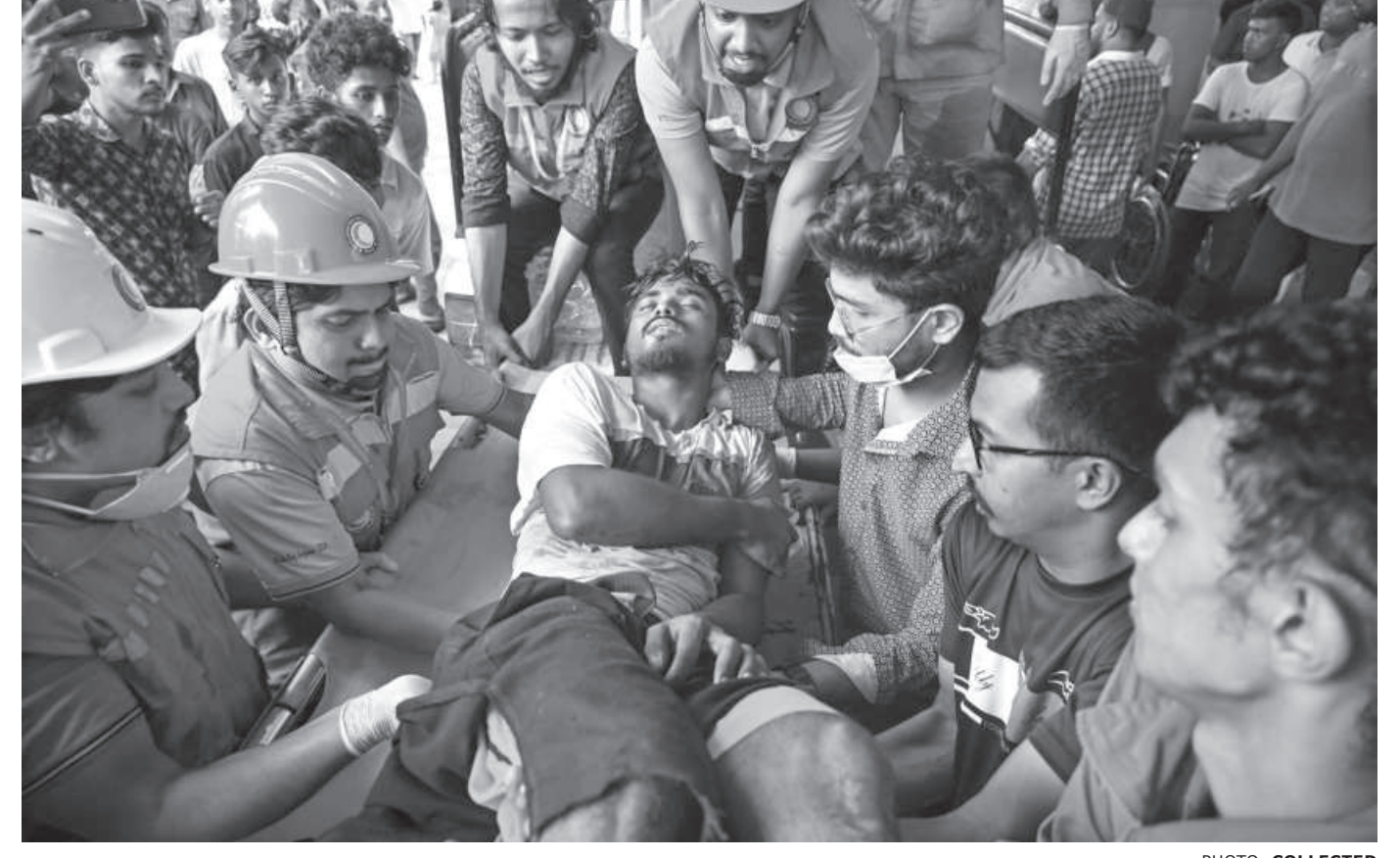
An injured person being taken to Chattogram Medical College Hospital yesterday. The atmosphere at CMCH turned grim from 11:45am as a continuous stream of injured individuals arrived. A total of 172 people were admitted to the hospital as of 9:00pm.

In the statement, TIB demanded that proper accountability for human rights violations of all types must be ensured via an internationally acceptable investigation conducted by a United Nations-engineered initiative.