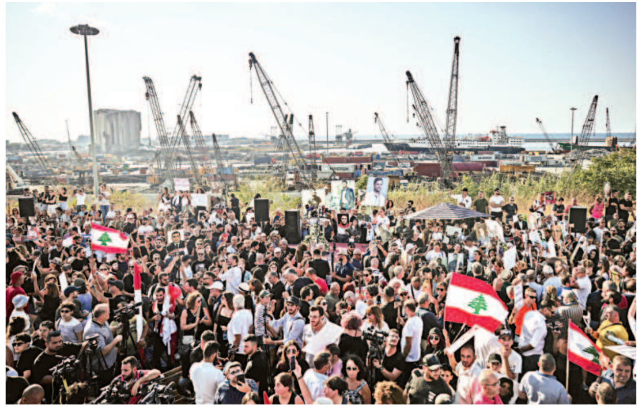
People take part in a march, as Lebanon marks the fourth anniversary of the explosion in the port of Beirut, Lebanon yesterday.

No protesters were found in Shabbagh, and police were seen positioned at every intersection on the campus when this report was filed at 8:00pm.