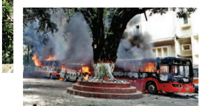
Plumes of smoke billowing from the Bangabandhu Sheikh Mujib Medical University as unidentified youths set fire to several vehicles, inset , parked inside the compound yesterday.