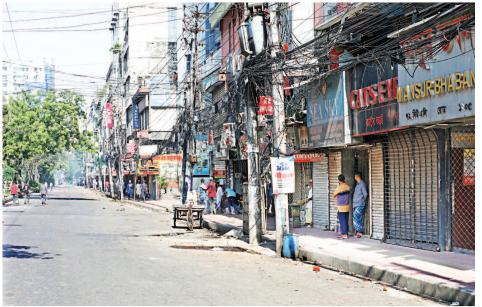
Rows of shops on Elephant Road that remained closed yesterday amidst a non-cooperation movement called by the Anti-Discrimination Student Movement.