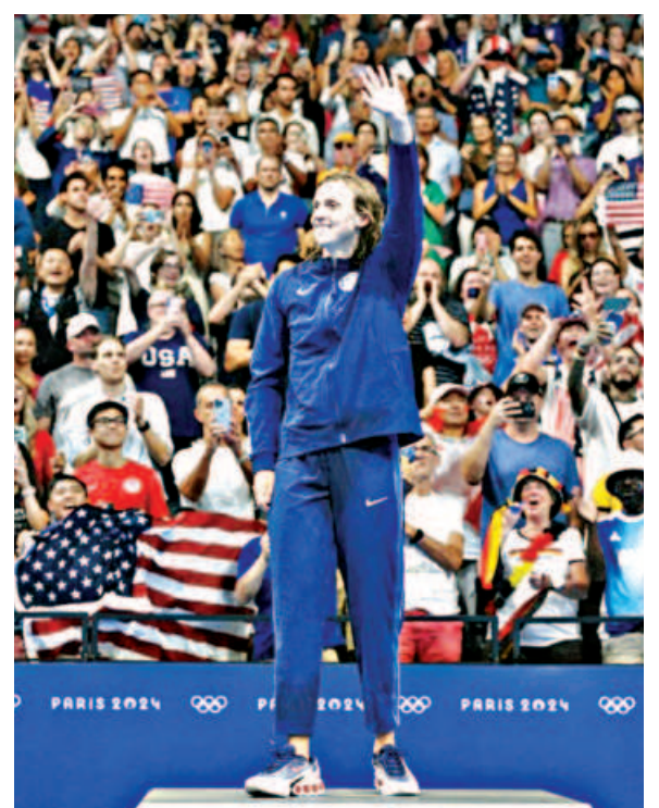
American swimmer Katie Ledecky celebrates on the podium after winning her ninth career Olympic gold, finishing first in the 800m freestyle in Paris on Saturday.