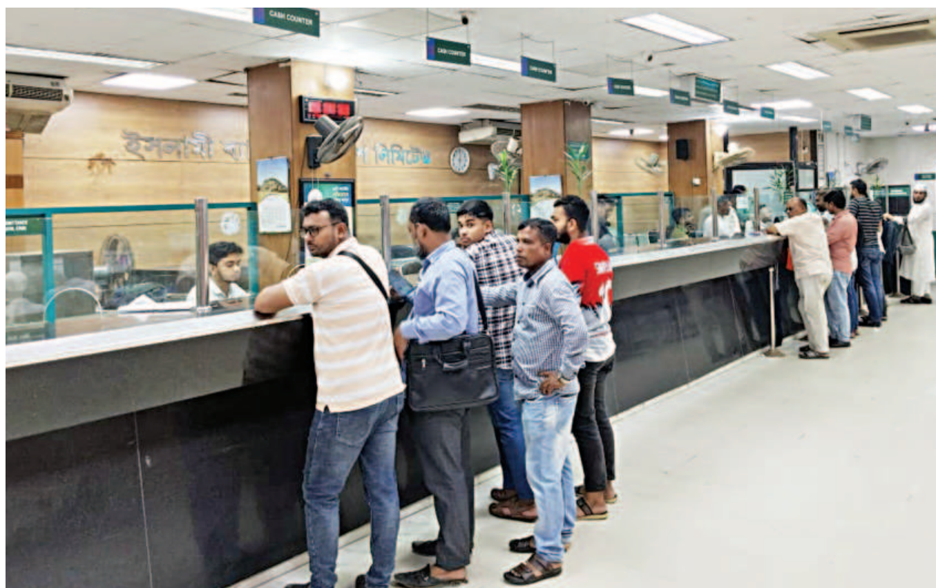
There were little to no banking activities yesterday amidst a non-cooperation movement called by the Anti-Discrimination Student Movement. The photo was taken at a bank in the capital's Motijheel.