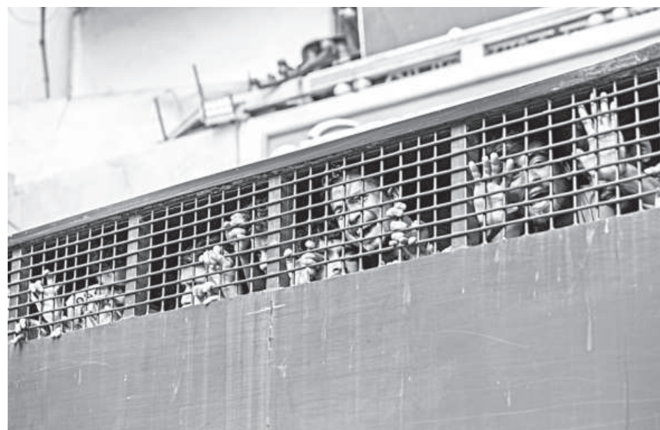
Suspects arrested during the block raids by law enforcement agencies are taken to a Dhaka court on July 23, 2024.

The problem with this order is that two kinds of people are sent to jail: those who are convicted and sentenced with imprisonment, and those who are sent to jail while their cases are still on trial. The jail code clearly states that all of them have the right to visitation by their families once a week for one hour. They are now being deprived of this legal right.