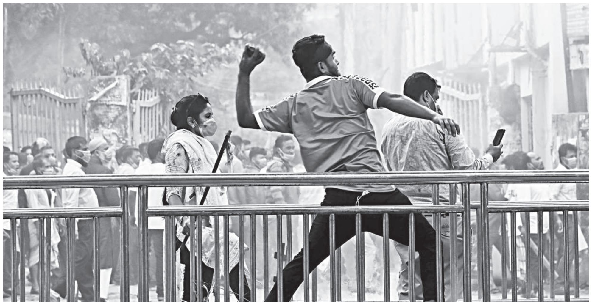
Burdened by the standard pessimism that comes with dreary middle age, you know that tyrants never go gentle into that good night.

official throws out a barrage of contradictions: protesters destroyed the internet lines, no no we shut it off to enforce law and order, no no we are working to restore internet, it's back but no no, not social media just yet. This is reminiscent of what Jacques Derrida called "kettle logic," based on a reading of Sigmund Freud's exchange with a man who tosses out