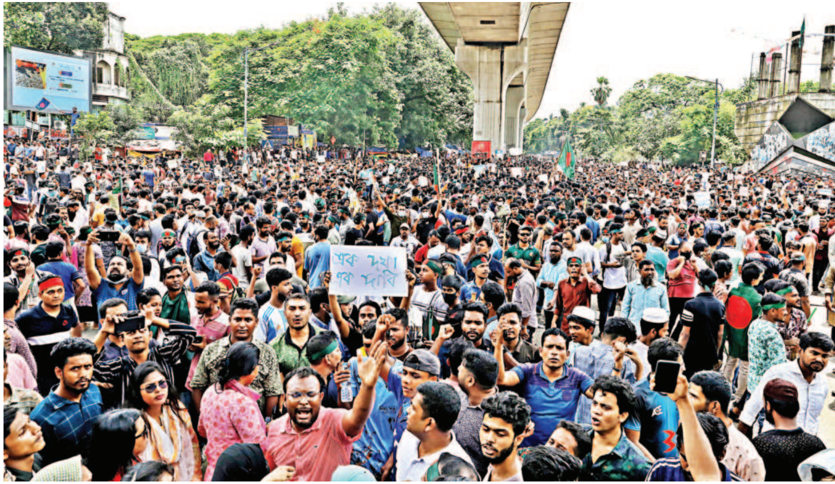
Protesters by the hundreds swarm the Shahbagh intersection in the capital yesterday, where later a fierce clash broke out between them and ruling party supporters on the first day of the nationwide non-cooperation movement announced by the Anti-Discrimination Students' Movement.