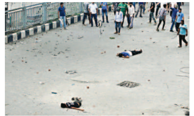
A wounded protester is being carried on a rickshaw in the capital's Farmgate area. Top right , an alleged ruling party activist chases protesters brandishing a firearm in Enayet Bazar area of Chattogram during a clash between the protesters, and police aided by ruling party men. Bottom right , two bullet-hit persons lie motionless on the street in Azampur of Uttara in Dhaka.