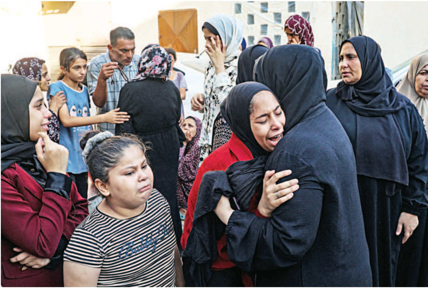
Palestinians mourn the dead in the aftermath of an Israeli strike that hit tents used as temporary shelters by displaced people in the courtyard of the Al-Aqsa Martyrs Hospital in Deir el-Balah in the central Gaza Strip yesterday.

About 90 people were arrested after skirmishes broke out at far-right rallies in numerous places including Liverpool, Manchester, Bristol, Blackpool and Hull, as well as Belfast in Northern Ireland.