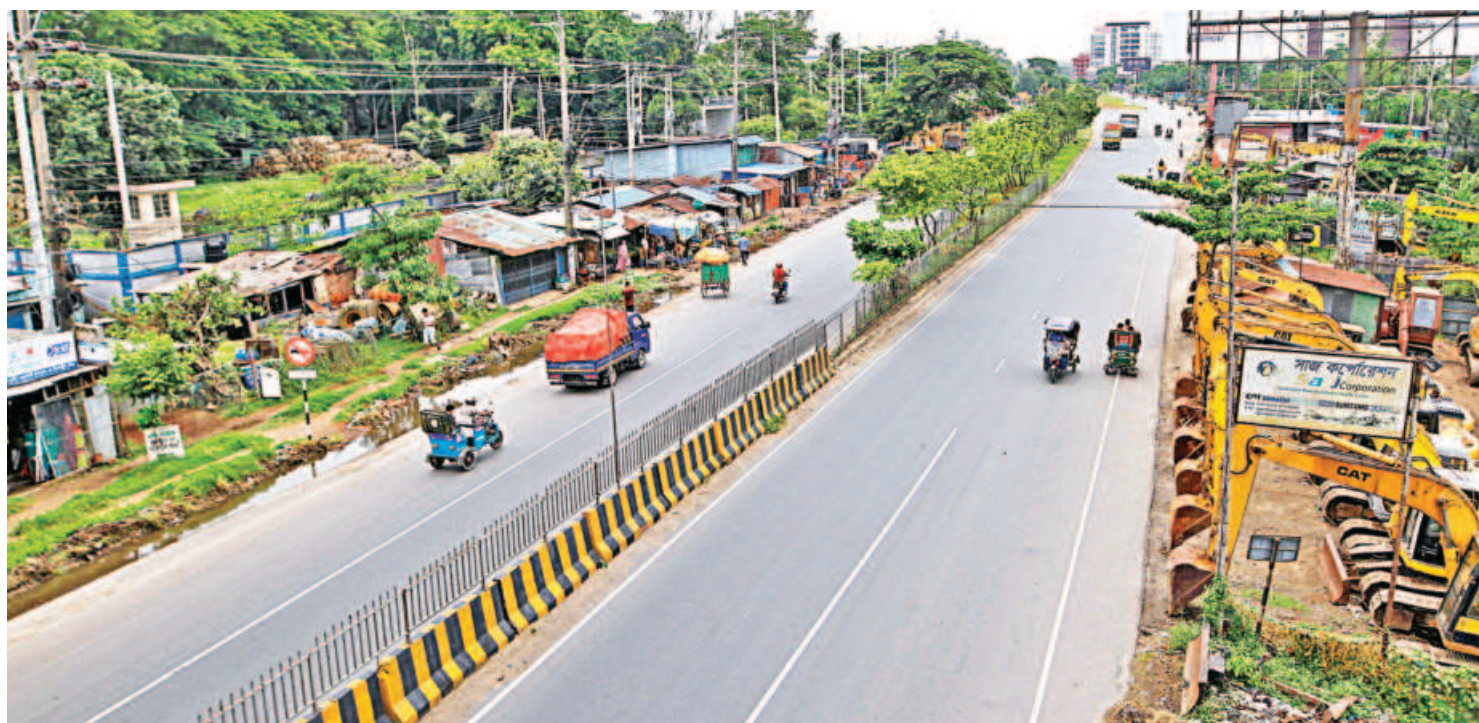
Transport operators were dealt a fresh blow as they are again being unable to ply the roads due to safety concerns. Although some are keen to make up losses of previous weeks and risk the journey, there are virtually no customers.

unrest has also affected the movement of inter-district passenger buses.