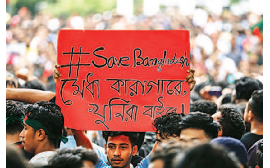
A protester holding a placard that states, 'Merit behind bars while the killers roam free.'

The prime minister should demonstrate her bona fides by offering