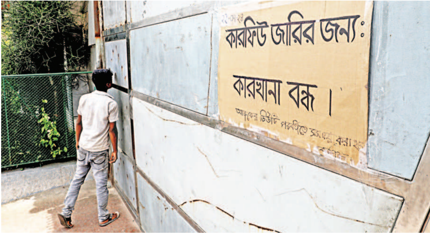
A sign on the wall of a garments unit states that the facility is closed due to the imposition of an indefinite curfew by the government because of heightened unrest around the country on the first day of a non-cooperation movement called by students.

Some factories were operational in Rugganj and Arahazar areas of Narayanganj district, said Mohammad