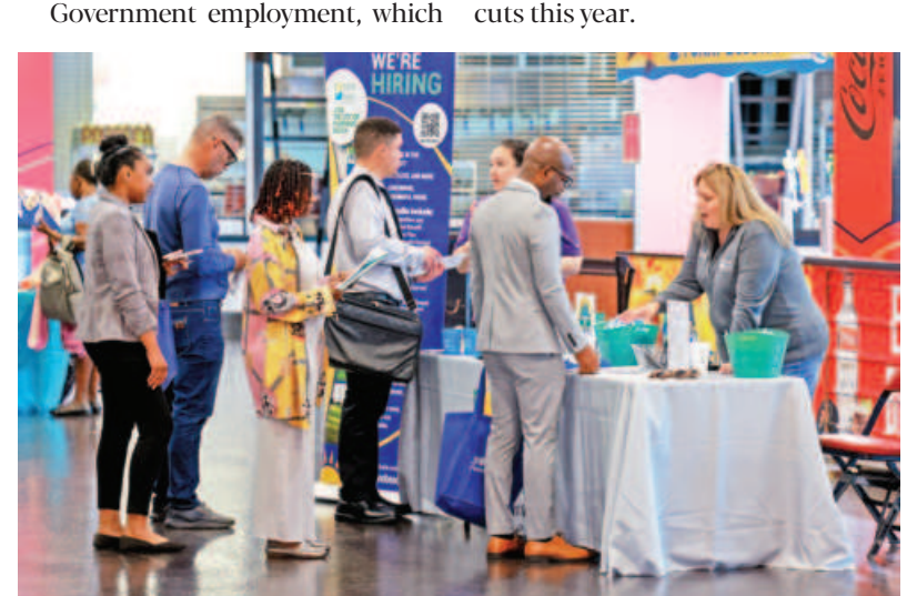
Recruiters speak to jobseekers during a job fair in Florida, US. The world's biggest economy added 114,000 jobs last month, down from June's