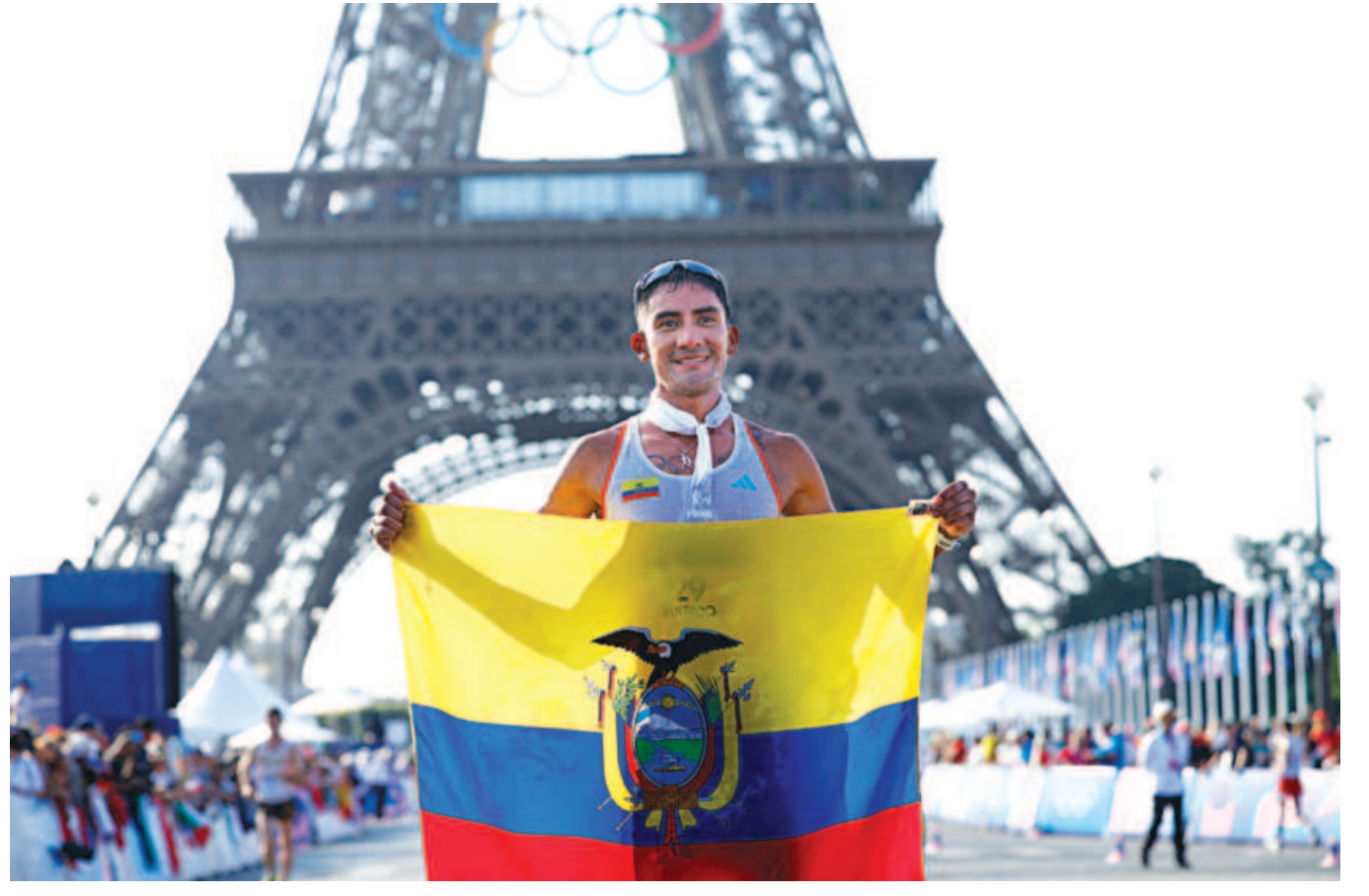
Ecuador's Brian Pintado holds his country's flag after clinching the gold medal in the men's 20km race walk with a time of 1:18:55 at the Paris Olympics yesterday, marking Ecuador's second Olympic title in the event and only its fourth gold medal overall. Pintado, wearing a scarf given by his grandmother and a necklace depicting his son running beside him, dedicated his historic win to his family back home.

Among those arrested in 27 districts in the 36 hours till 6:00pm yesterday, 11 each were held in Khulna, Rajshahi, and Pabna; nine in SEE PAGE 6 COL 1