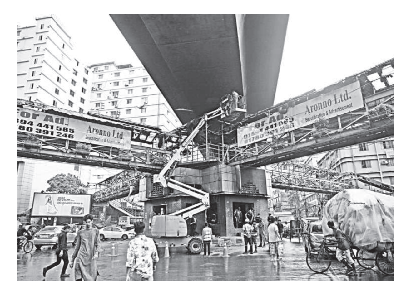
Employees of Dhaka Mass Transit Company Limited inspect a section of the metro rail at the Mirpur 10 intersection area yesterday. During the recent unrest in the country, this foot-bridge was set on fire, which is why the DMTCL is checking to see if any damage occurred to the metro rail.

He said firearms were seen in the hands of law enforcers and the Chhatra League and Jubo League. "Despite this, the government continues to repeat this chorus of lies in a superficial attempt to obscure the truth.