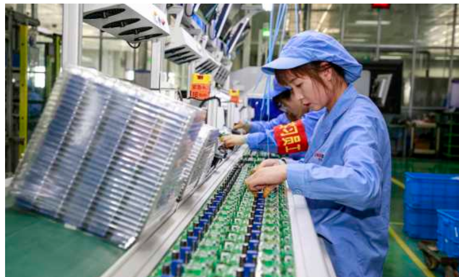
Employees work on an electric meter production line at a factory in Yinchuan, in northwestern China's Ningxia region. China's Caixin/S&P Global manufacturing PMI sank to 49.8 in July from 51.8 in the previous month.