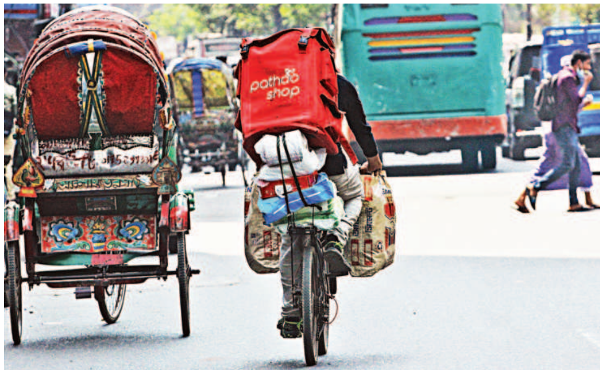
Delivery personnel were heavily impacted by the recent internet blackout as 95 percent of all e-commerce transactions remained suspended for 13 days in July amid the quota reform movement across Bangladesh.

Key demands included extension of bank loan repayment periods by at least six months for affected entrepreneurs, provision of loans on easier terms, temporary waivers on VAT for logistics and digital marketing, waivers and extensions for trade licence renewal fees, government intervention to negotiate refunds or re-advertisement options for active ads on Facebook during internet shutdown.