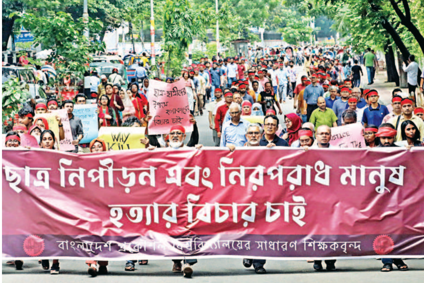
Demanding justice for the killings and torture of students and innocent bystanders, teachers of Bangladesh University of Engineering and Technology bring out a procession on the campus yesterday.