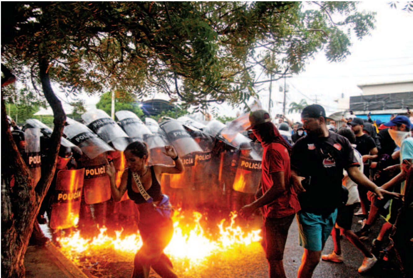
Demonstrators react when molotov cocktails hit the ground in front of security forces during protests against election results after Venezuela's President Nicolas Maduro and his opposition rival Edmundo Gonzalez claimed victory in presidential election, in Puerto La Cruz, Venezuela on Monday.

Many Venezuelans staged "cacerolazos", a traditional Latin American protest where people bang pots and pans in anger. Some blocked roads, lit fires and threw petrol bombs at police. At least four people were killed as police fired tear gas and rubber bullets at protesters.