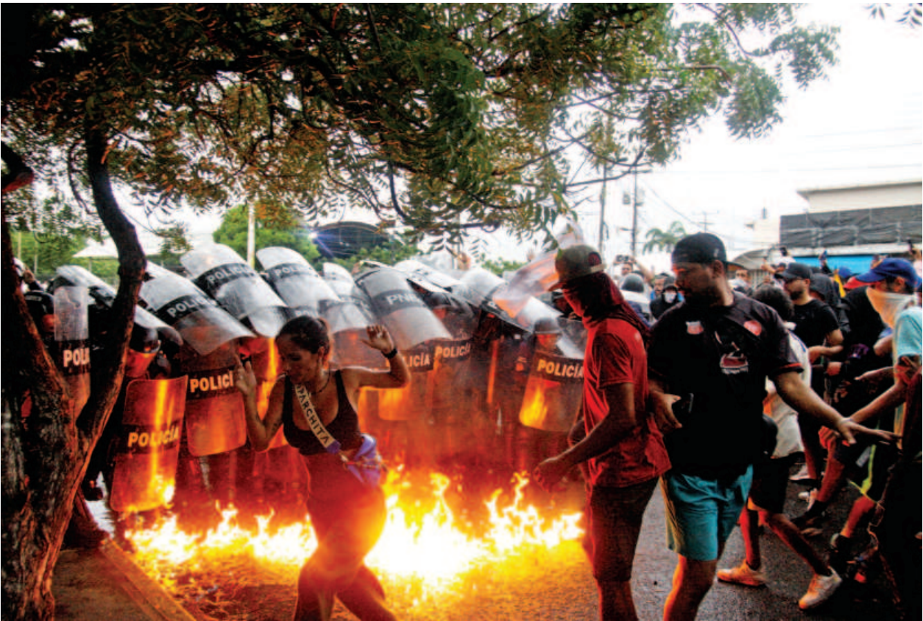
Demonstrators react when molotov cocktails hit the ground in front of security forces during protests against election results after Venezuela’s President Nicolas Maduro and his opposition rival Edmundo Gonzalez claimed victory in presidential election, in Puerto La Cruz, Venezuela on Monday.

REUTERS, Caracas Protests spread around Venezuela yesterday and police fired tear gas in the capital Caracas as the opposition said it had voting tally proof it won a weekend election awarded to long-ruling socialist President Nicolas Maduro. Demonstrations began after the election board, which critics say is in the pocket of a dictatorial government, declared on Monday that Maduro had won a third term with 51 percent of the vote, extending his “Chavista” movement’s quarter-century rule. But the opposition said the 73 percent of vote tallies to which it has access showed its candidate Edmundo Gonzalez had won by a landslide, with more than twice as many votes as Maduro. Many Venezuelans staged “cacerolazos”, a traditional Latin American protest where people bang pots and pans in anger. Some blocked roads, lit fires and threw petrol bombs at police. At least four people were killed as police fired tear gas and rubber bullets at protesters.