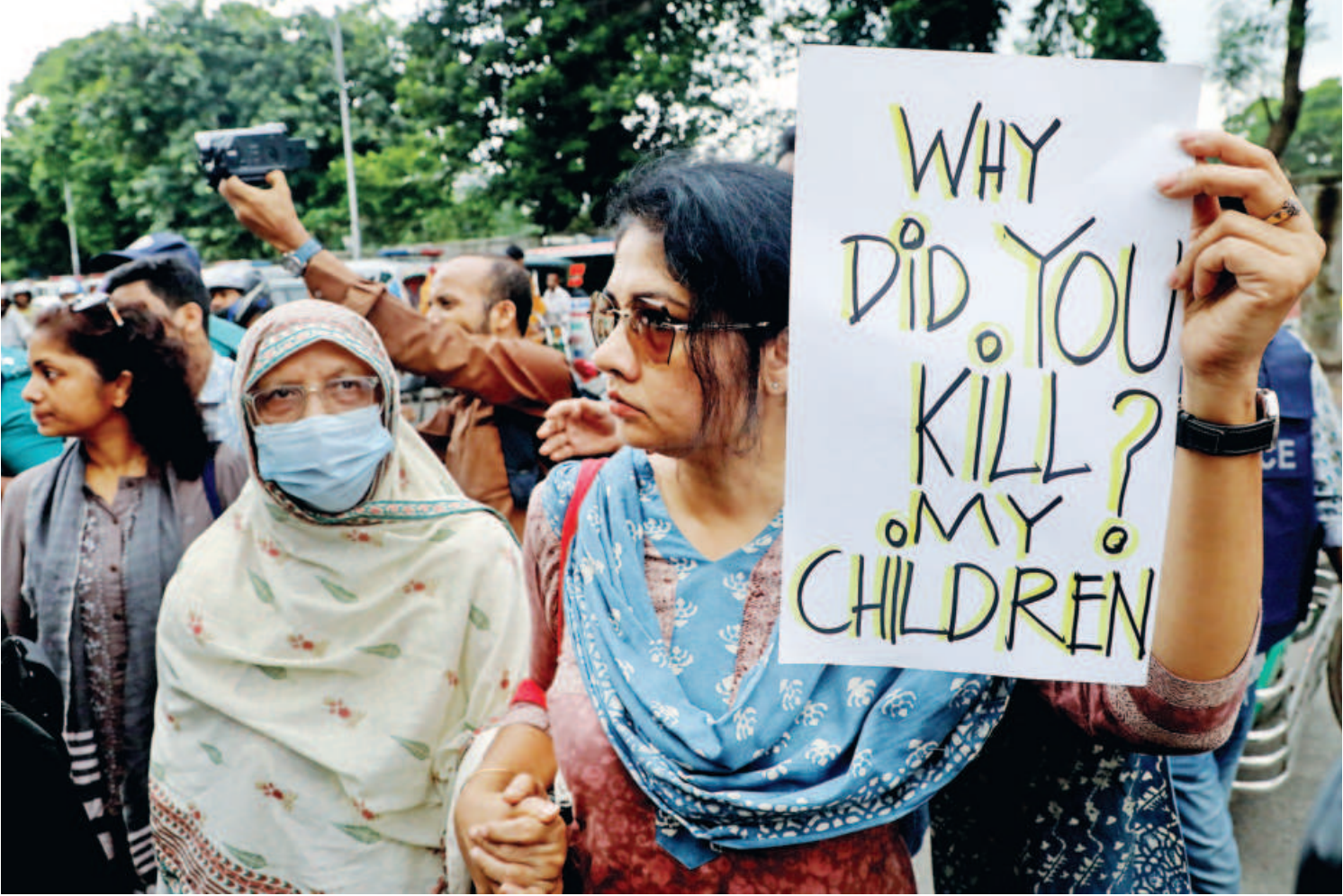
GUARDIANS BESIDE CHILDREN. Holding a placard that says “Why did you kill my children?”, a guardian leaves the premises of Dhaka Medical College yesterday after law enforcers barred them from holding a sit-in there.