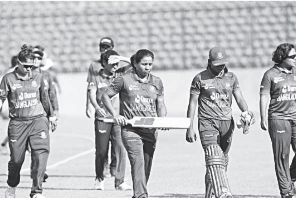
The Bangladesh women's cricket team failed to capitalise on their existing strengths against India in the Asia Cup semifinal match.

Since the Bangladesh team was not in its best form before the tournament, the fact they had qualified for the semifinals should have come as a welcome validation of their competitive abilities. However, it must be mentioned that there seems to exist a significant gap in the quality of cricket played by the top four teams—India, Pakistan, Sri Lanka and Bangladesh—versus the rest of the teams. While India established their