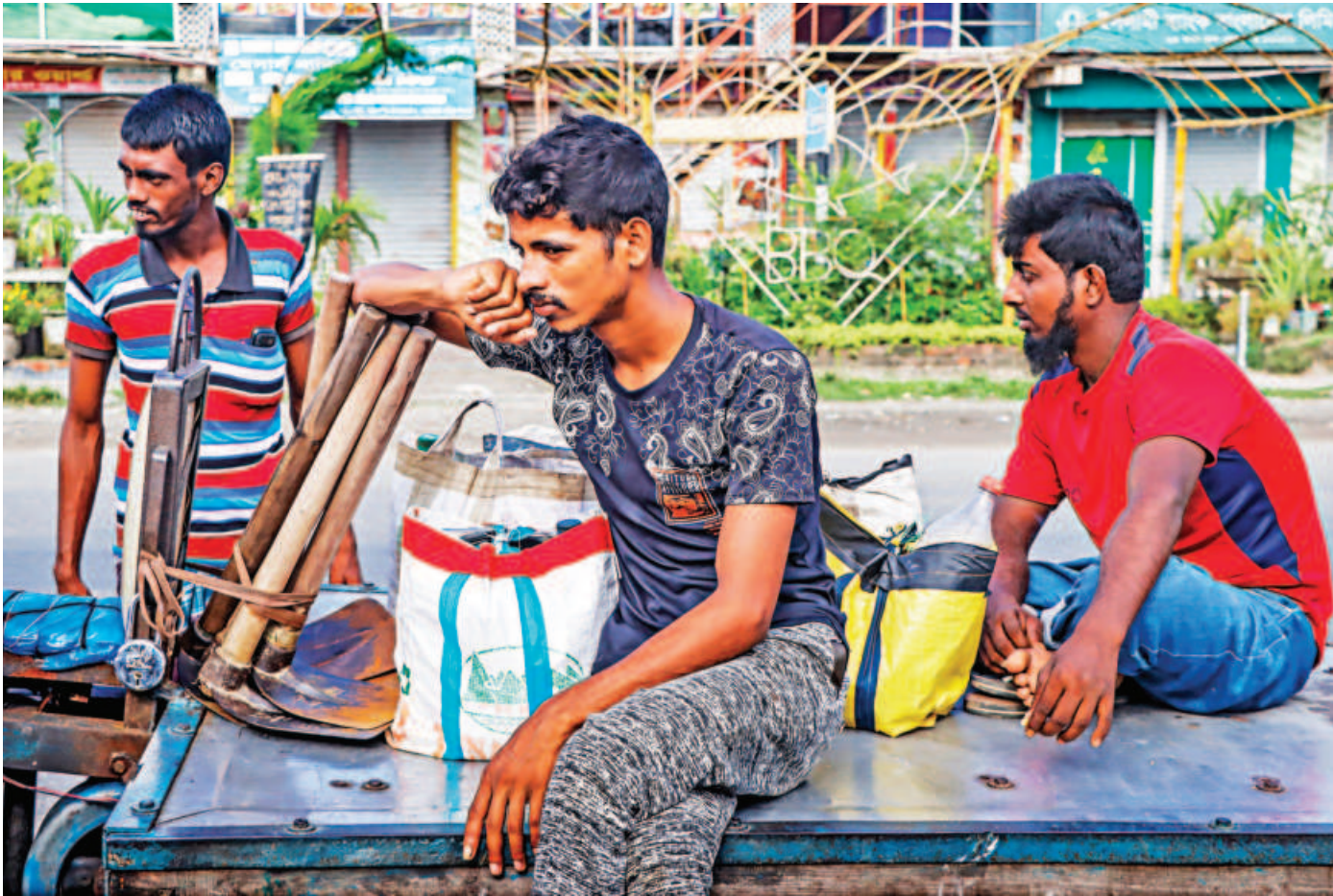
Construction workers, hit by days of unemployment amid the curfew, are whiling away the morning in the Bypass area of Khulna city in the hope of getting hired.