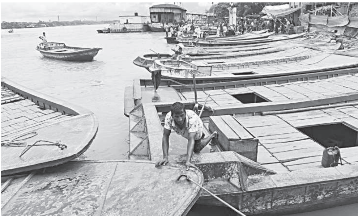
Boatmen in Barishal are counting losses as their engine-driven trawlers remain anchored on the bank of the Kirtankhola river amid the ongoing curfew. However, with the curfew being relaxed for longer hours, things are slowly returning to normal. The photo was taken yesterday.