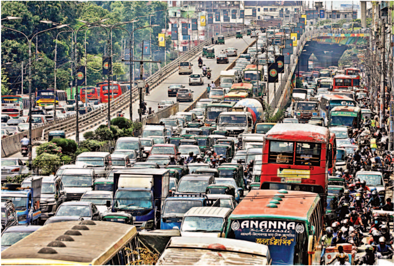
Congestion on Airport Road in the capital's Kakoli yesterday morning during the break in curfew. In the absence of metro services, the elevated expressway, and trains, some of the roads in the city are seeing additional load of traffic.