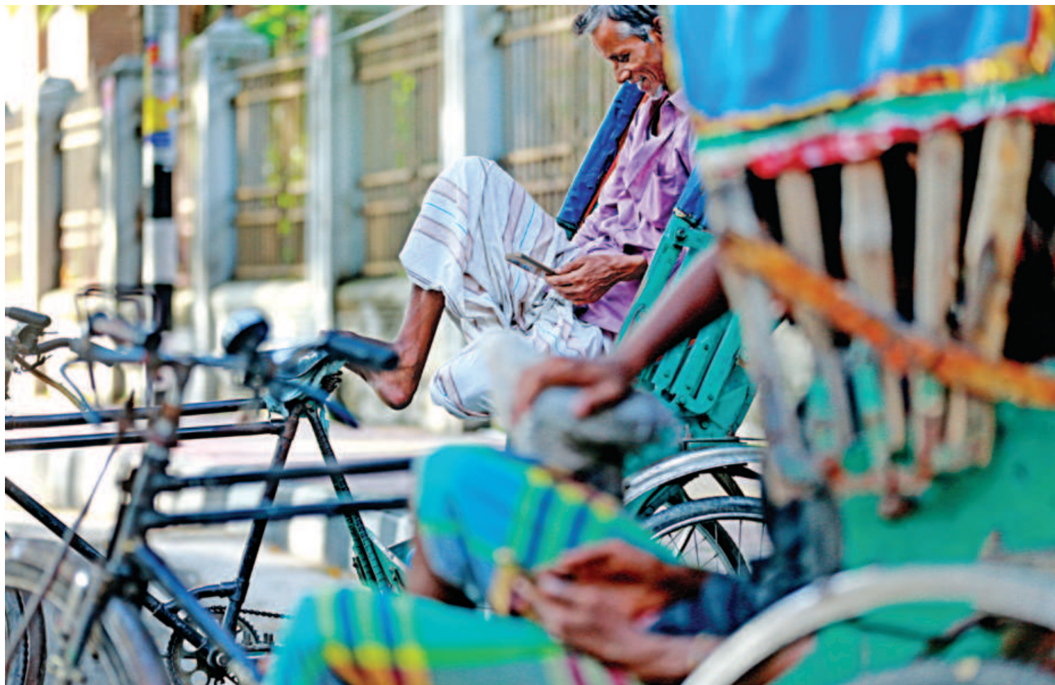
Sitting on his rickshaw, a man looks at his smartphone, finally able to experience the internet again after mobile data connections were restored yesterday. While broadband was restored on July 23, a large number of internet users, who rely on mobile data service, remained disconnected until last afternoon. The photo was taken on Fuller Road.