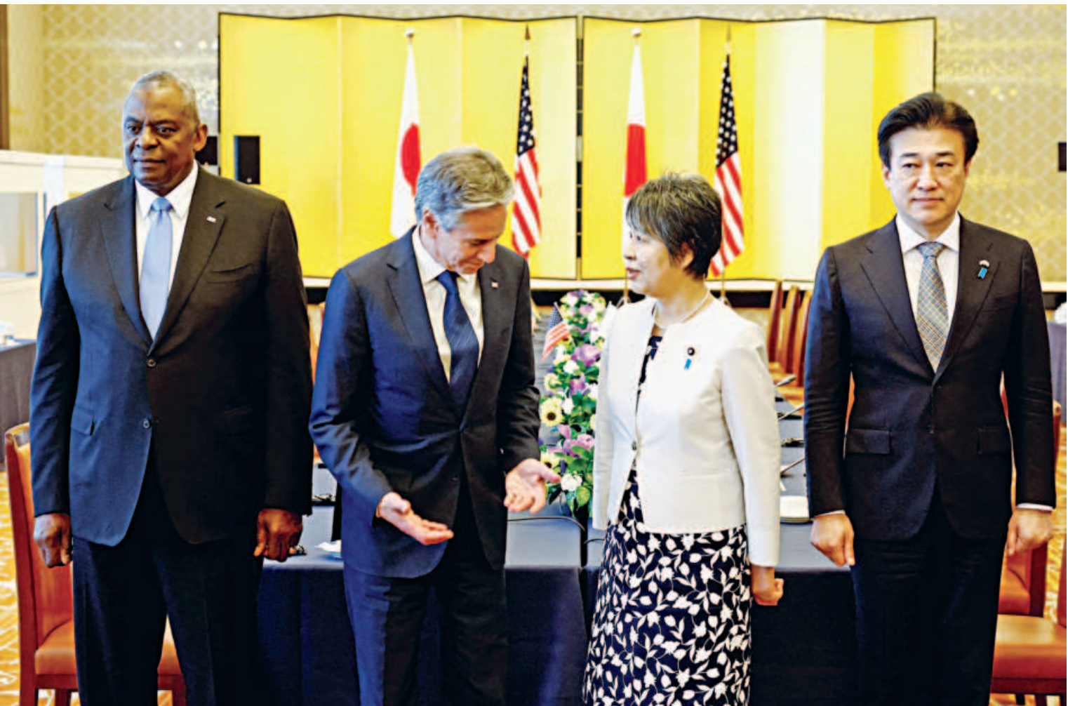
US Secretary of State Antony Blinken and Secretary of Defense Lloyd Austin meet with Japanese Foreign Minister Yoko Kamikawa and Defense Minister Minoru Kihara at their Foreign and Defense Ministerial (2+2) Meeting at Iikura Guest House in Tokyo, Japan yesterday.

It will serve as a counterpart to Japan's planned Joint Operations Command for all its armed forces, making the two militaries more nimble in the case of a crisis over Taiwan or the Korean peninsula.