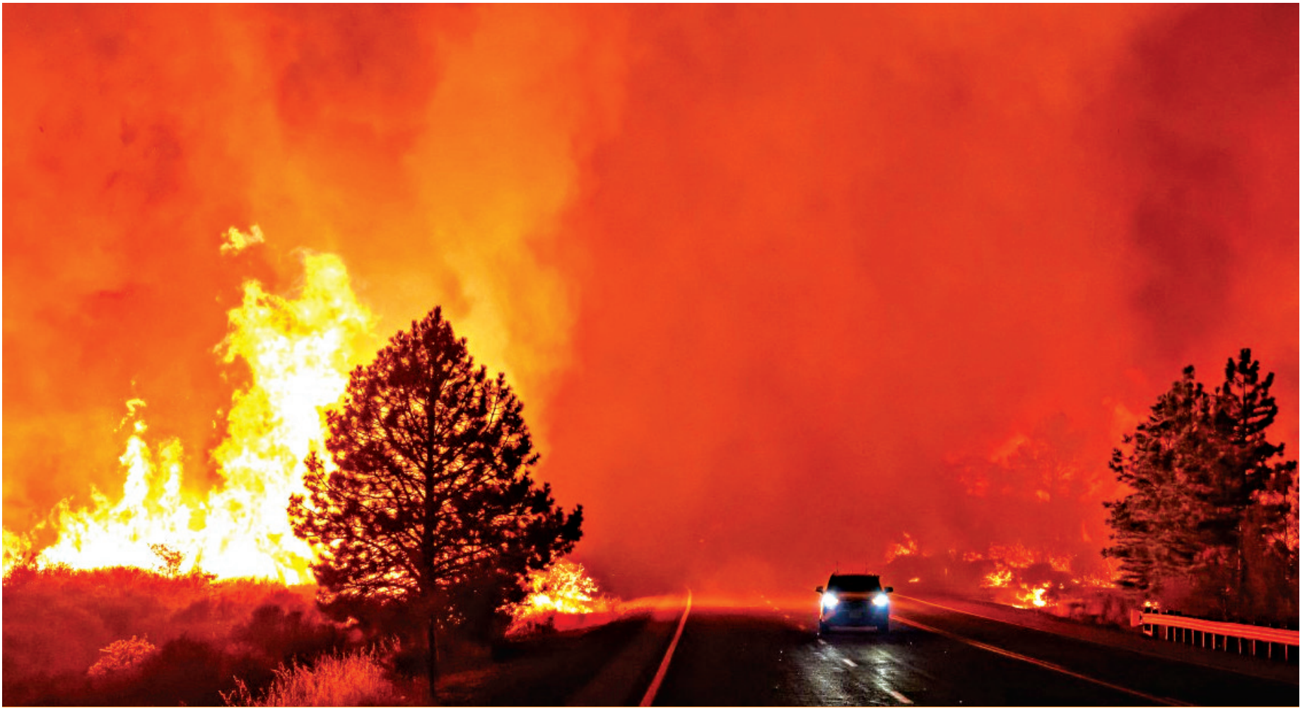
A vehicle drives along Highway 36 while flames tear through the area as the Park fire continues to burn near Paynes Creek in unincorporated Tehama County, California. The so-called Park Fire burned more than 350,000 acres as of Saturday evening, making it the seventh-largest ever recorded in California history, the Cal Fire said.