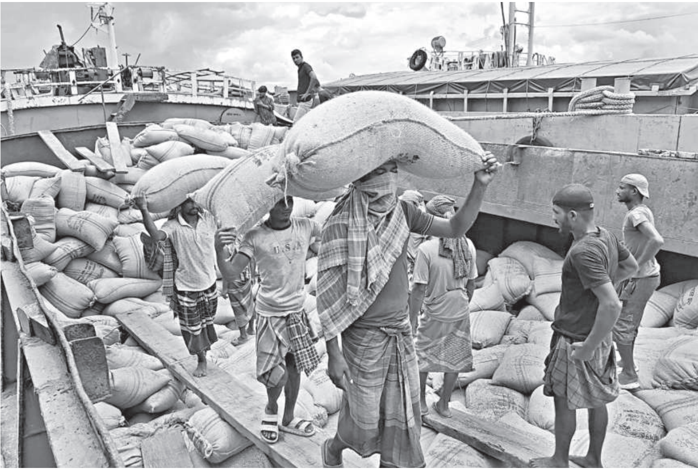
Workers load bags of wheat onto a truck, hoping to get all of it stacked and ready to head to a warehouse in Barishal amid the curfew break yesterday afternoon. The photo was taken at the Mongla Port.

"Farmers prepared huge seed beds so that they could recoup the losses caused by the flood. We are closely monitoring the situation and advising farmers about cultivation," she added.