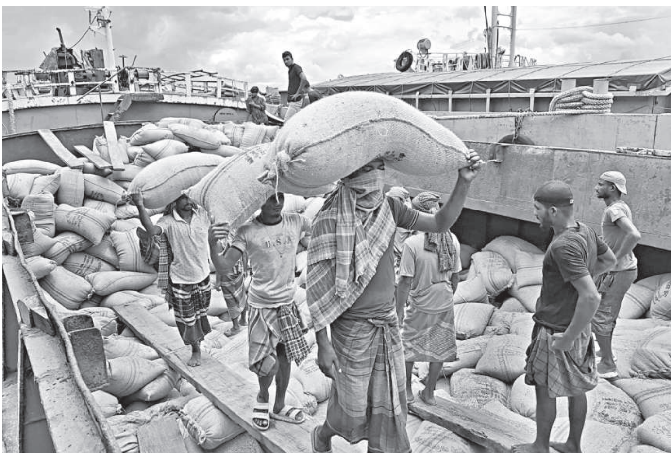
Workers load bags of wheat onto a truck, hoping to get all of it stacked and ready to head to a warehouse in Barishal amid the curfew break yesterday afternoon. The photo was taken from Band Road.