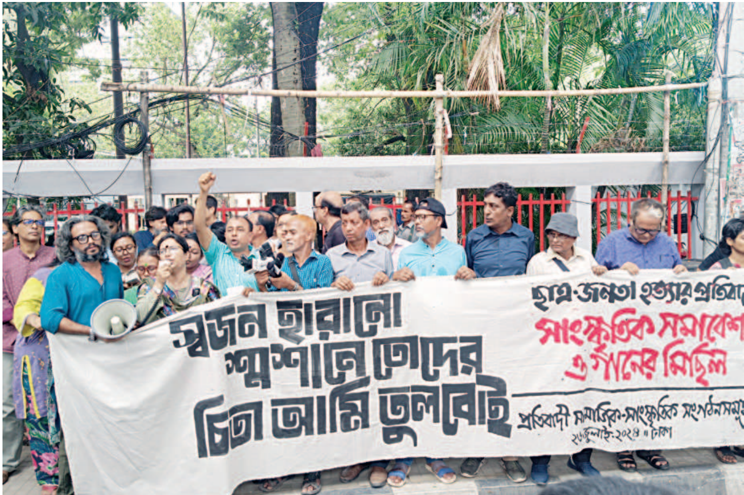
Various cultural and social organisations form a human chain in front of Jatiya Press Club yesterday morning, demanding fair and impartial investigations into the violence and killings centring the quota reform protests under the United Nations.