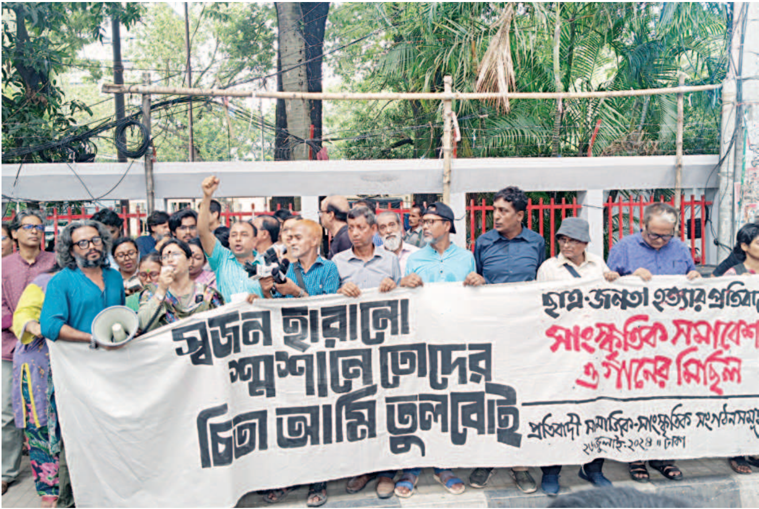
Various cultural and social organisations form a human chain in front of Jatiya Press Club yesterday morning, demanding fair and impartial investigations into the violence and killings centring the quota reform protests under the United Nations.