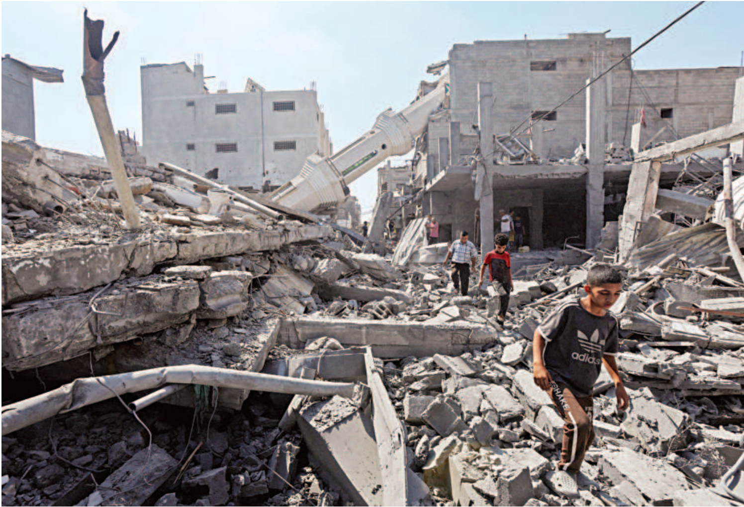
Palestinians inspect the damage as the collapsed minaret of Abdullah Azzam mosque leans against a house after the mosque was hit by an Israeli strike in Nuseirat refugee camp in the central Gaza Strip.