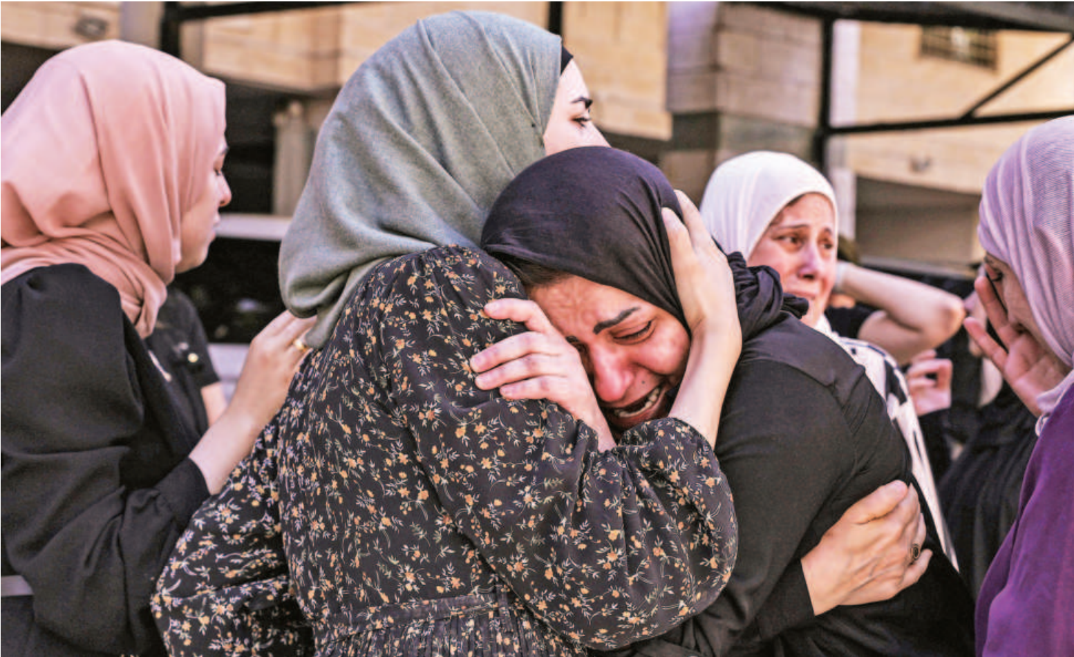
The mother of a 20-year-old Palestinian of Gazan origin is being comforted by others as she mourns her son after he was killed during an Israeli army raid in al-Bireh north of Ramallah in the occupied West Bank. The photo was taken on Wednesday.