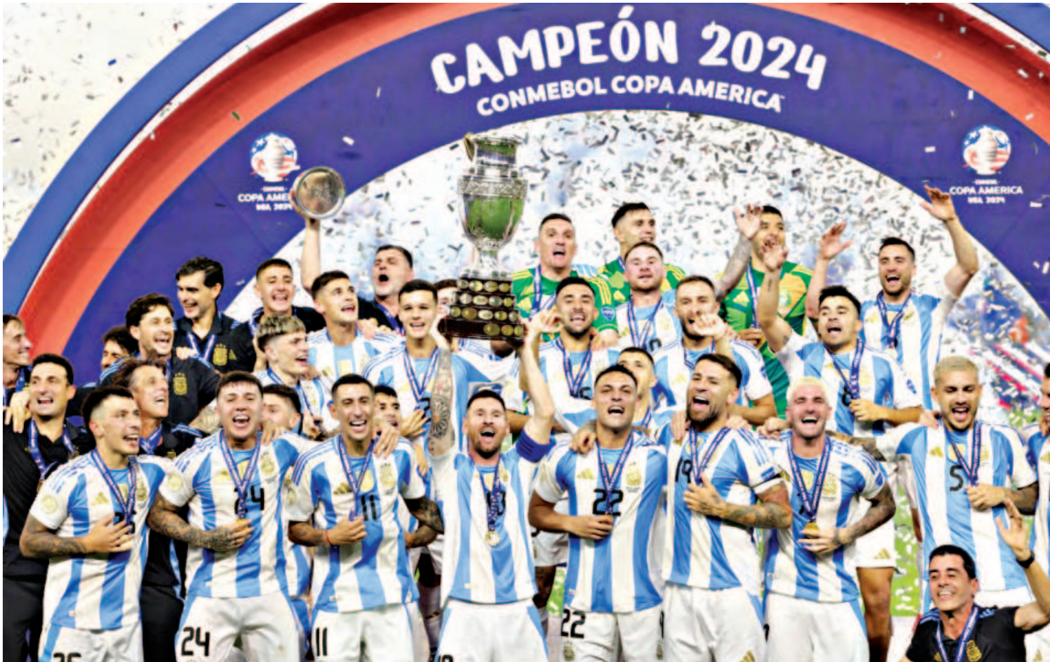
Argentina captain Lionel Messi, flanked by his teammates and coaching staff, lifts the Copa America trophy after the world champions beat Colombia 1-0 in extra time in the final at the Hard Rock Stadium in Miami yesterday.