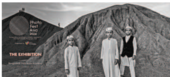
Photo Fest Asia 2024