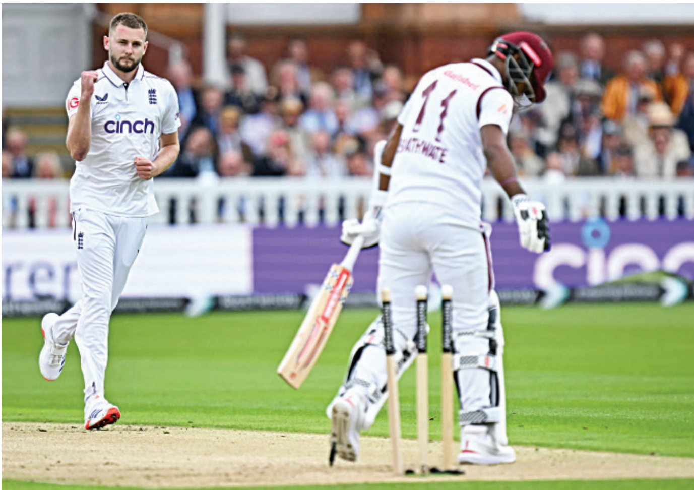
England pacer Gus Atkinson celebrates after casting West Indies captain Kraigg Brathwaite on Day 1 of the first Test at Lord's yesterday. On his debut, the 26-year-old right-arm pacer was the destroyer-in-chief for his side as he returned seven wickets for 45 to help bundle out the visitors for 121.