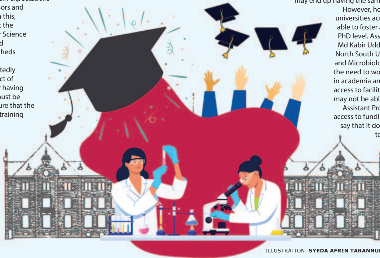
ILLUSTRATION: SYEDA AFRIN TARANNUM

As such, the reality of the situation highlights several systemic barriers that stand in the way of private universities from being functional institutions able to grant PhDs. However, is it not time for these things to slowly take change?