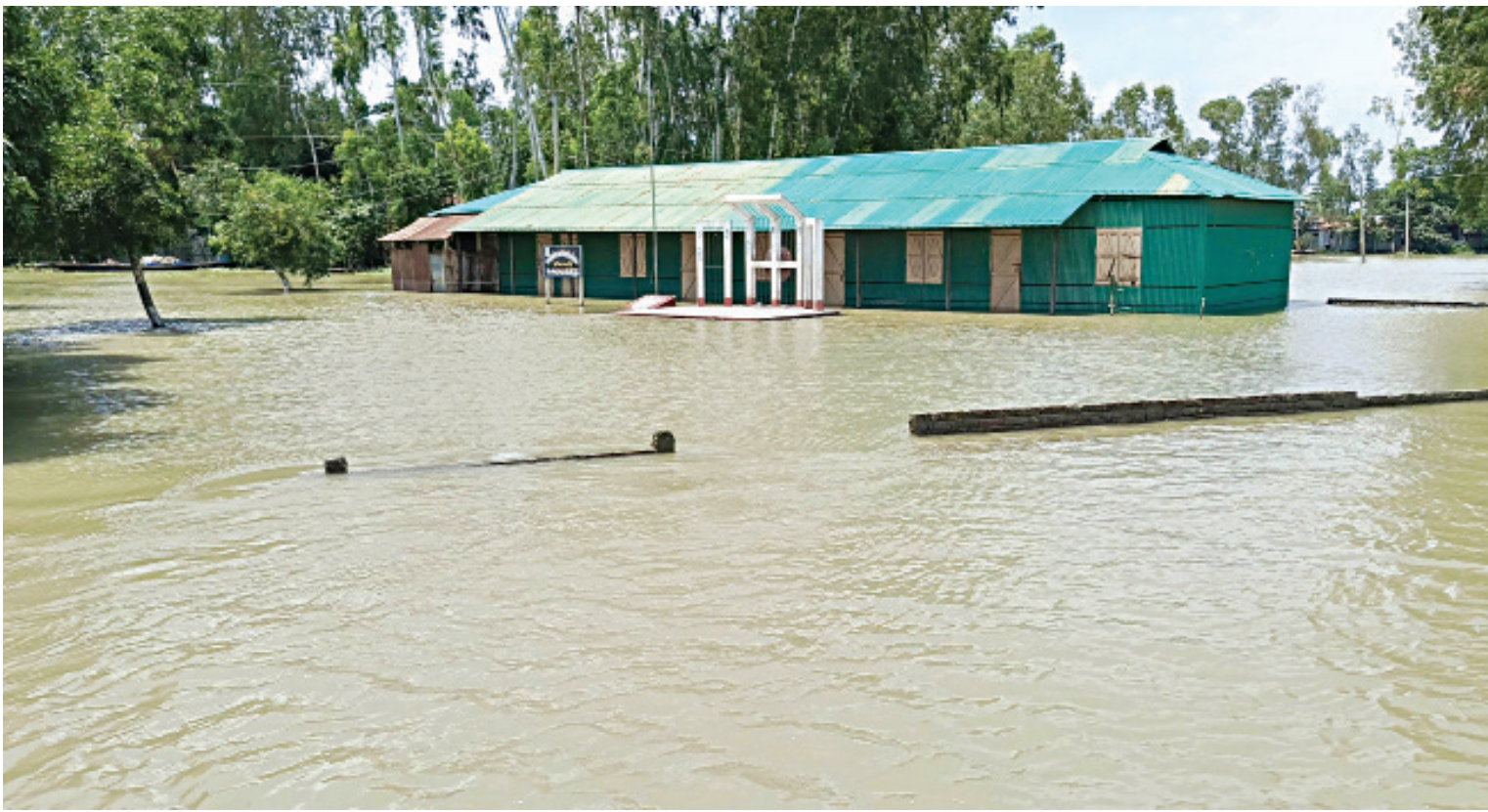
The Patrakhata Feichka Government Primary School in Putimari char area of Kurigram's Chilmari upazila has been submerged for the past one week. With the Brahmaputra still flowing above the danger level, at least 80 homesteads, along with croplands, remain flooded in this area. The photo was taken yesterday.