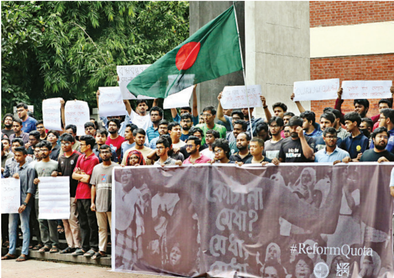
Buet students demonstrate in front of the main entrance to the university in the capital yesterday demanding scrapping of the quota system in government jobs. Students of most of the public universities across the country have also been boycotting classes and exams since Saturday to press home their demand.