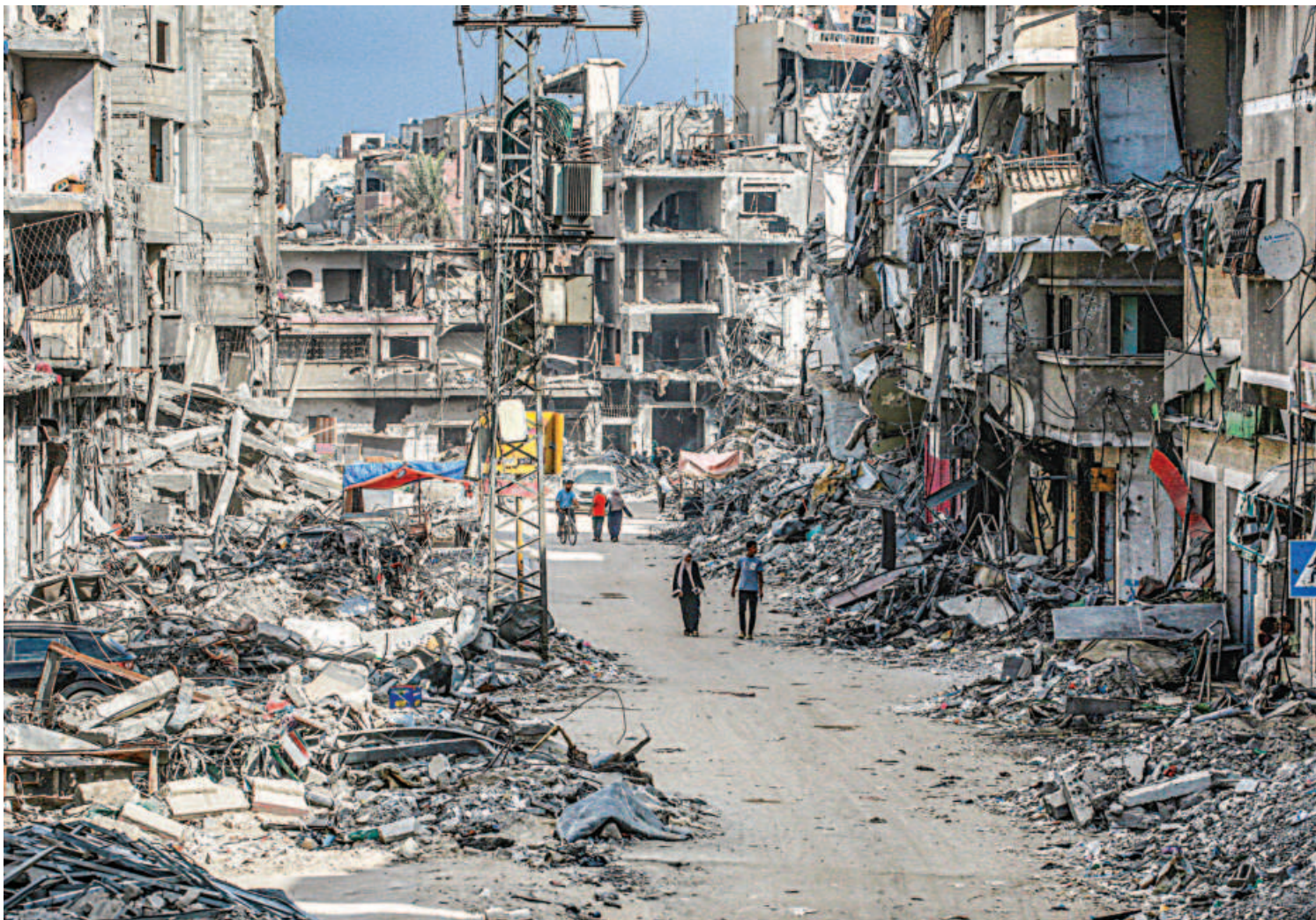
People walk past the rubble of destroyed buildings along a street in Khan Yunis in the southern Gaza Strip yesterday.