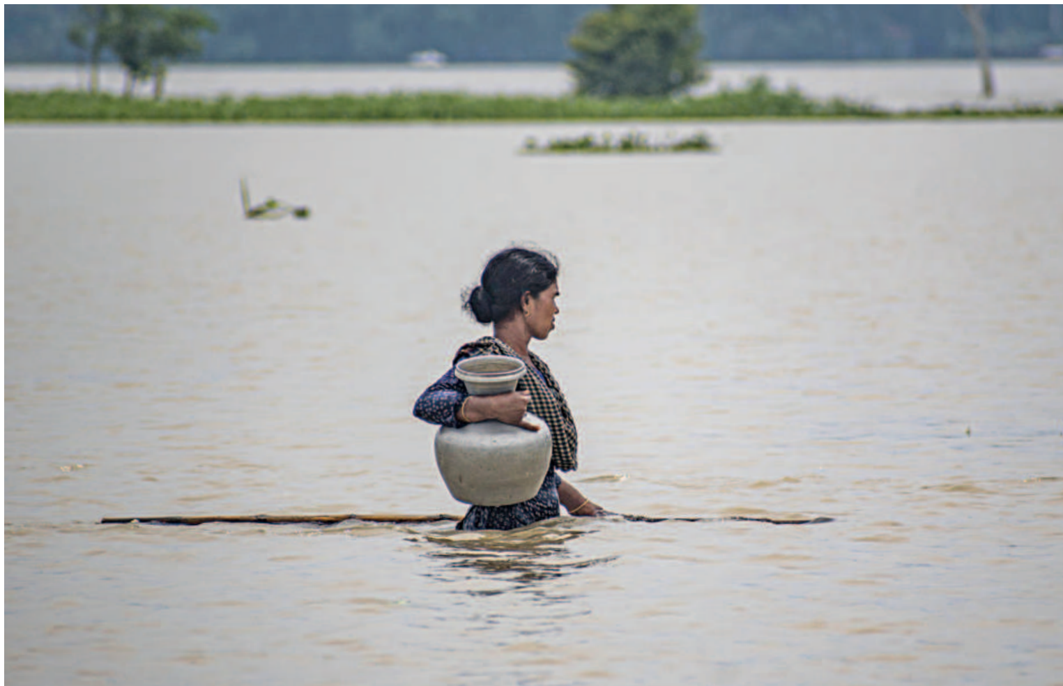
A woman walks through waist-deep water to return home after collecting drinking water from a tubewell some miles away on a higher land in Uria Char of Gaibandha's Phulchhari upazila recently. Around 65,000 families have been marooned due to floods caused by the swelling of the Brahmaputra, which is currently flowing 70cm above the danger level. Stories on page 5.