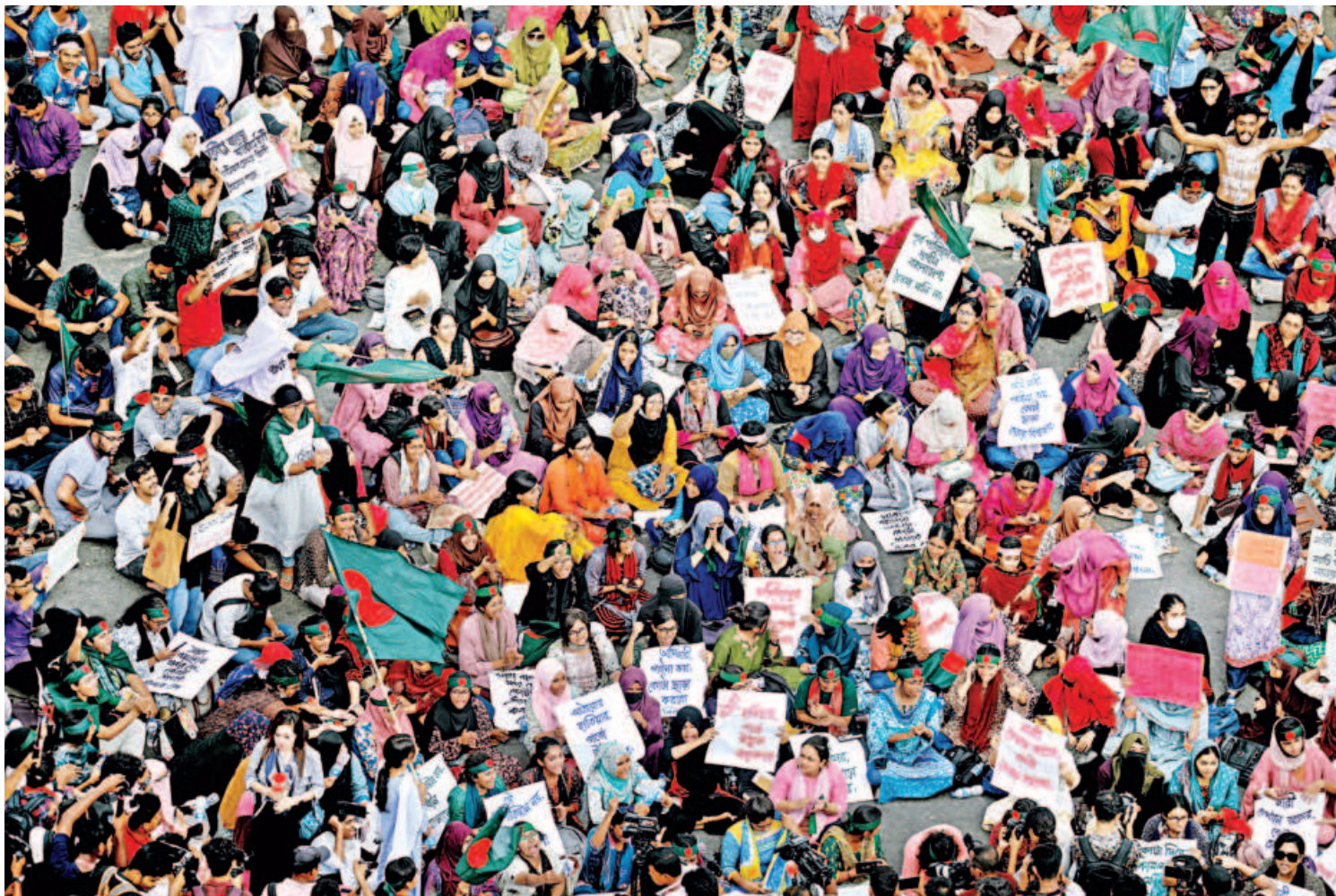
Thousands of anti-quota protesters took over and blocked the capital's Shahbagh intersection yesterday afternoon as part of the "Bangla Blockade" programme

The MoUs expected to be signed will be on economic and banking sectors; trade and investment; digital