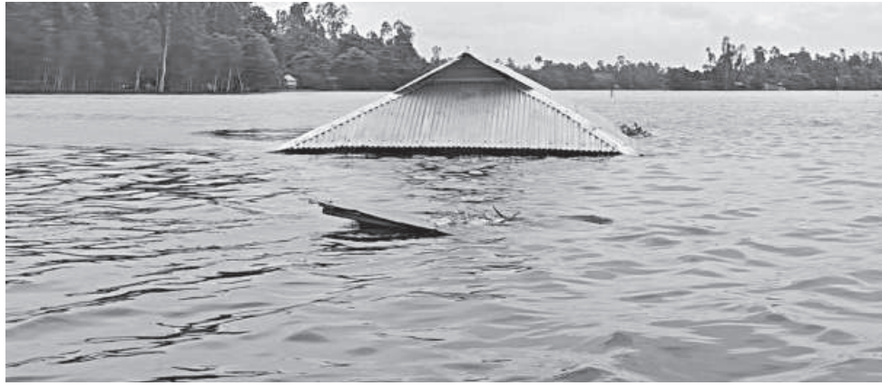
This tin roof belongs to Uttar Majherchar Govt Primary School in Krishnapur village under Kurigram Sadar upazila. The entire school is now submerged due to flood.

"With the water level of Brahmaputra continuing to rise, more schools in these areas may have to suspend classes," he added.