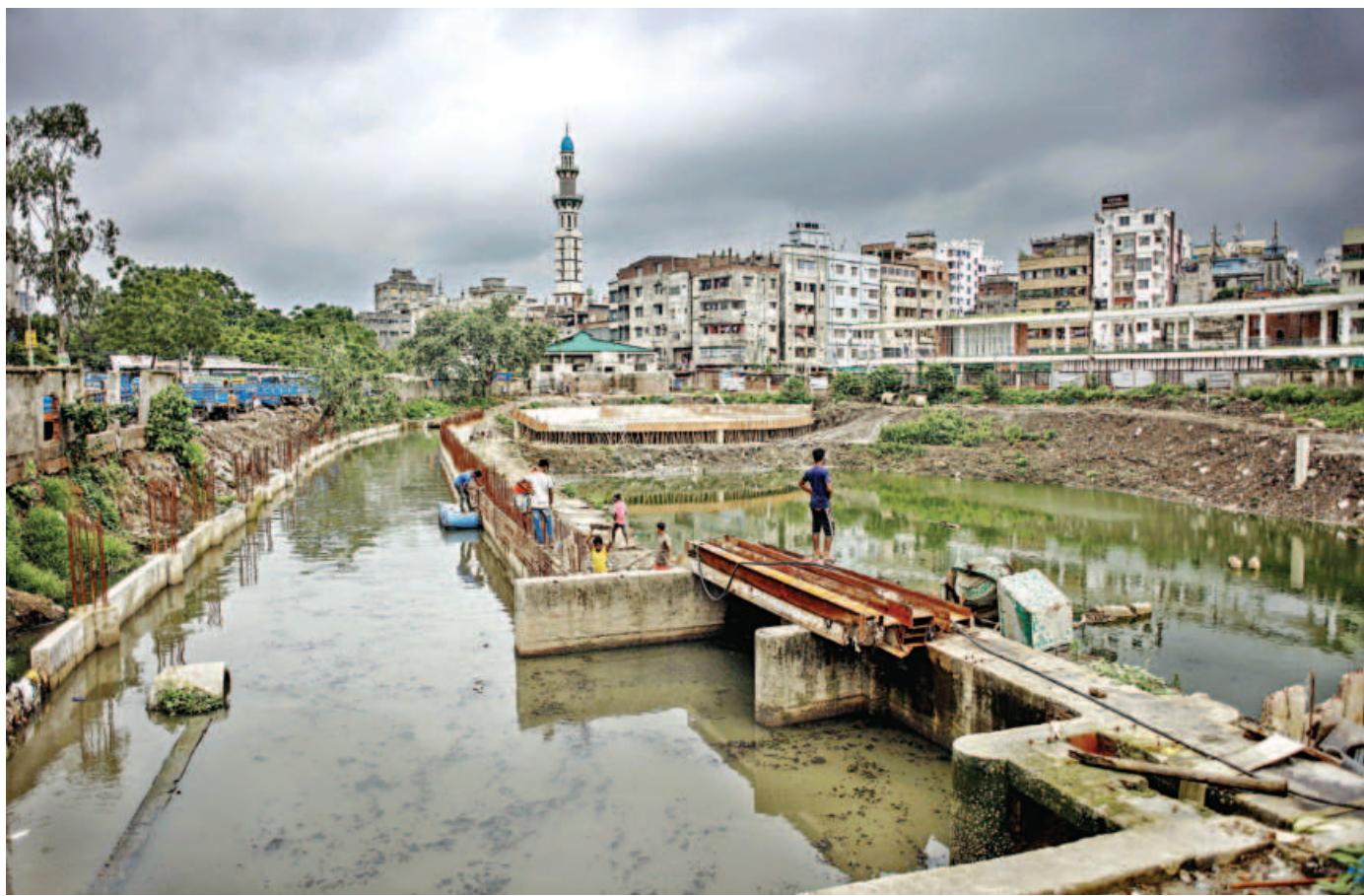
The capital's Dholaiakhal, which has been in a sorry state for years, is going to change. Dhaka South City Corporation has taken up a project to build two amphitheatres, walkways, bicycle lanes, and improve the waterbody on five acres.

About the album of the pictures on the country's history drawn by the children with special need, she said it will help them know the country's history.