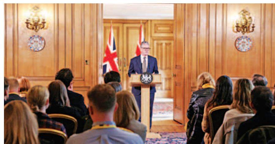
Britain's Prime Minister Keir Starmer holds a press conference at the end of his cabinet's first meeting in Downing Street in London yesterday. Keir has promised investment in key areas such as health and education but also stresses the need to balance the books.

"Labour talked a lot about wanting to boost the economy and help businesses during its election campaign," noted