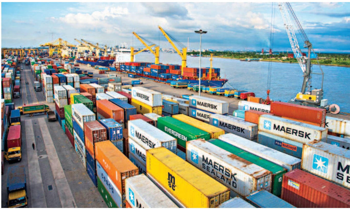
Contrary to what was hitherto believed, merchandise exports declined 6.8 percent in July-April of FY24 relative to the same period in FY23, driven primarily by a 6.7 percent decline in garment exports.

So much for the complacent claims of having resolved the current account deficit problem through import compression. The latter helped reduce the current account deficit that exceeded $10 billion in July-March FY23, but the deficit, which grew to over $5.7 billion in July-April, is still large. It would not have been worrisome if driven by a surge in investment induced imports. But the deficit came from a decline in exports, notwithstanding a 12.3 percent decline in merchandise imports. The decline in imports in turn reflected not just a 6.3 percent decline in RMG related goods but also 20.7 percent decline in import of capital goods. Weaknesses in both