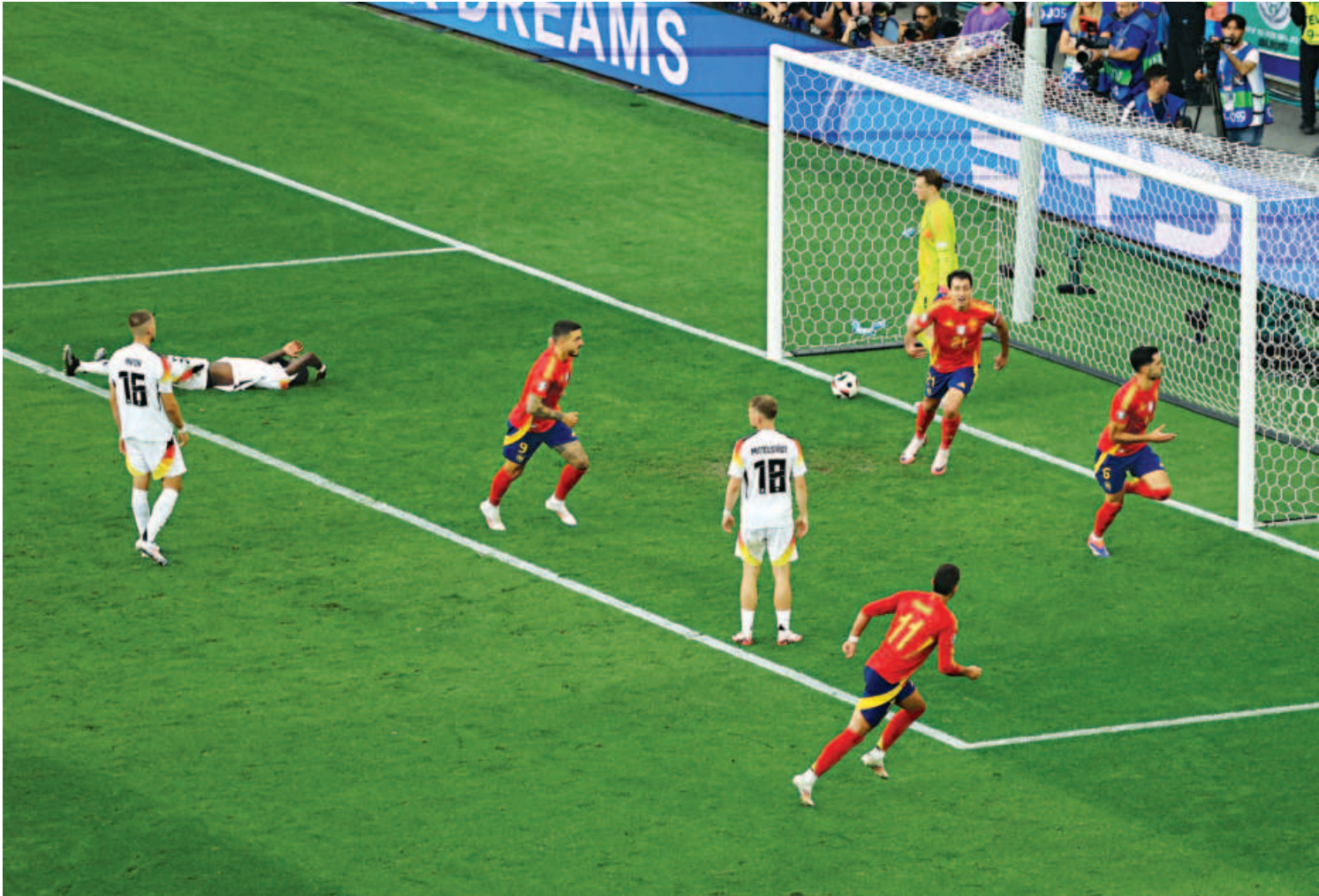
Spain midfielder Mikel Merino celebrates with teammates after heading home a 119th-minute winner in a 2-1 win over Germany in a Euro 2024 quarterfinal at the Stuttgart Arena in Stuttgart on Friday.