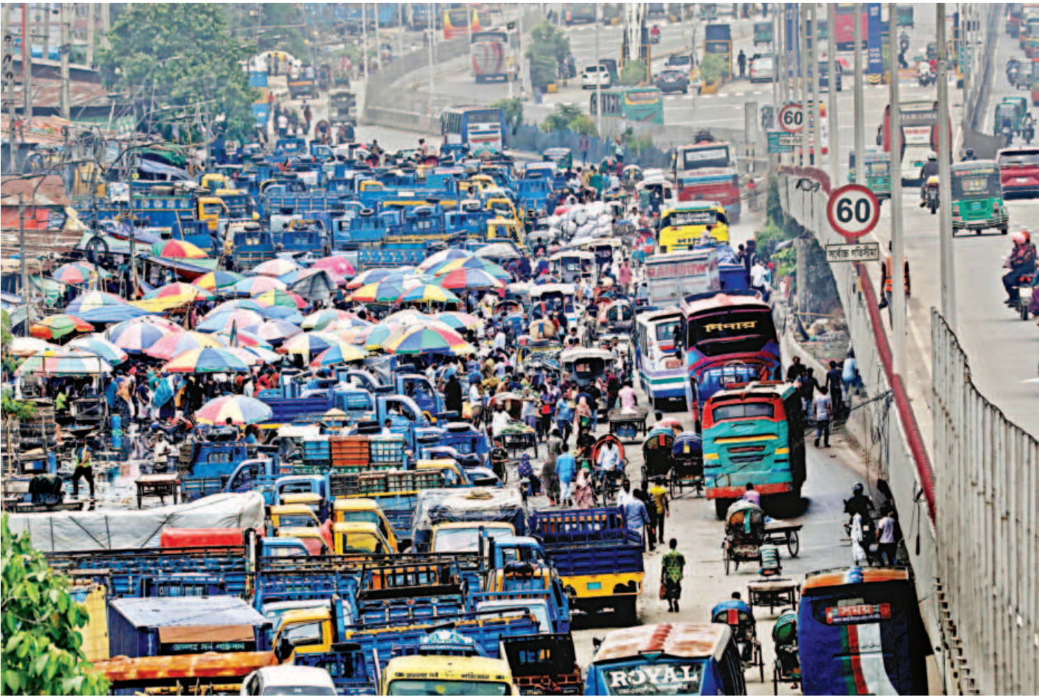
Parked pickups take up a large part of the Dhaka-Chattogram road next to the wholesale fish market in the capital's Jatrabari, leaving little room for vehicles to pass through. The traffic situation is aggravated by some makeshift shops under big umbrellas. The photo was taken around noon yesterday.

STAFF CORRESPONDENT Four US senators, including the Senate majority whip, issued a statement demanding an immediate end to what they said was harassment of Prof Muhammad Yunus, adding that the “seemingly personal vendetta” against him will negatively impact the US-Bangladesh partnership. They also urged the Bangladesh government to respect democratic values and institutions. The statement dated SEE PAGE 6 COL 1