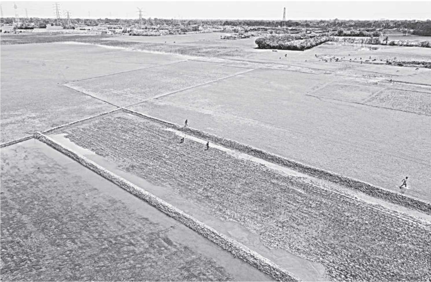
Traditionally, by the first week of Ashar (monsoon), farmers prepare Aman paddy seedbeds. However, due to a lack of rain, farmers are yet to prepare seedbeds this time around. The photos were taken at Tetultala beel and Batiaghata upazila recently.