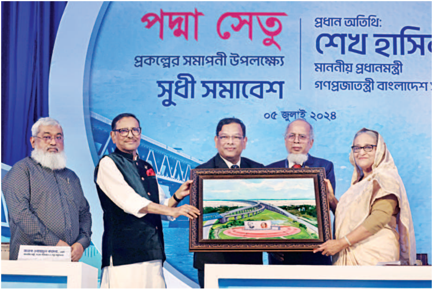
Prime Minister Sheikh Hasina being presented with a framed painting of the Padma Bridge at a rally in Munshiganj yesterday. The rally was organised on the occasion of the closing ceremony of Padma Multipurpose Bridge Project.