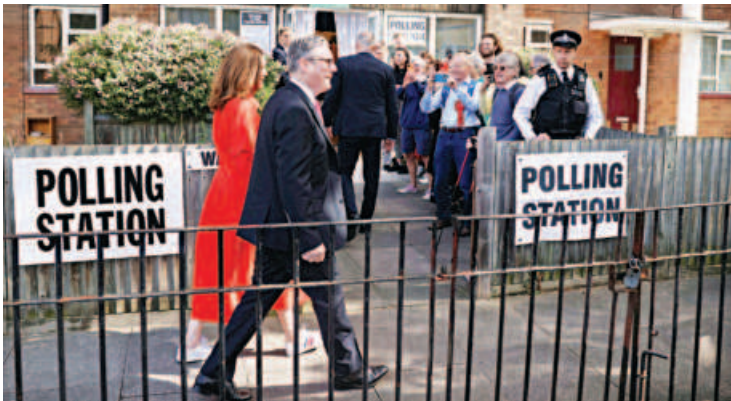
Britain's Labour Party leader Keir Starmer and his wife Victoria Starmer arrive at a polling station to cast their votes during the general election in London, Britain, yesterday.