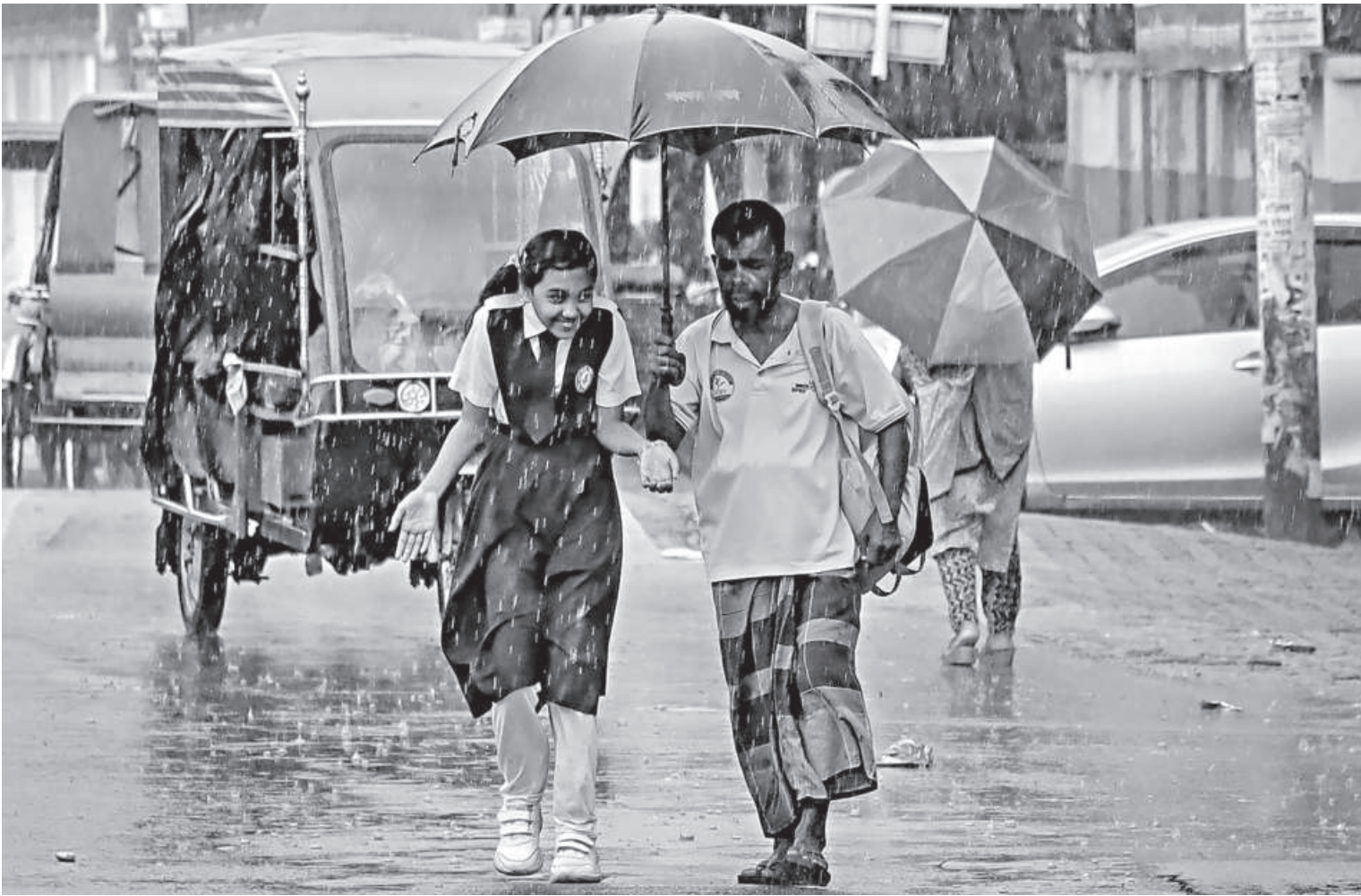
While returning from school, a girl sticks her hand out to touch the rainwater while her guardian tries to shelter her with an umbrella. The photo was taken in front of Khalishpur Navy School in Khulna yesterday.