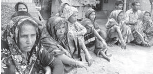
Many families alleged that they did not get homes or solar facilities.