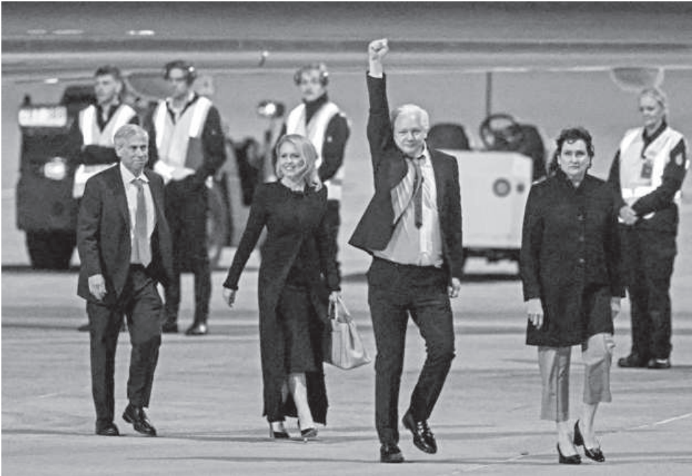
WikiLeaks founder Julian Assange gestures as he arrives in Canberra, Australia, on June 26, 2024.